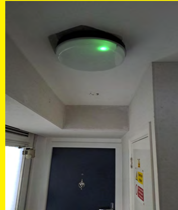
Emergency lighting at Mary Green Tower.

Emergency lighting provides illumination in instances where mains power may have failed. It illuminates escape routes, emergency exit/s and firefighting equipment. It will provide illumination to signage and provide sufficient lighting to help you to escape.