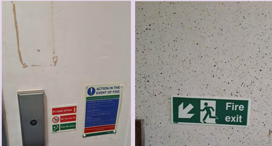
Fire Action Notice and Fire Exit Sign at Mary Green Tower.

We have installed Fire Action Notices and Fire Exit Signs in your building.