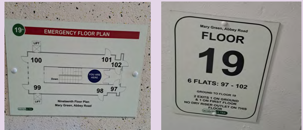
Various wayfinding signage at Mary Green Tower.

Wayfinding signage is a visual communication tool to assist the Fire and Rescue Service in locating specific flats as they navigate their way round a building.