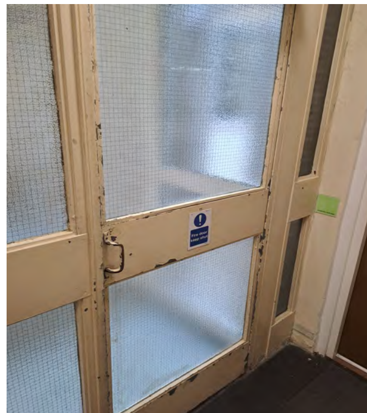
Communal fire door at Mary Green Tower.