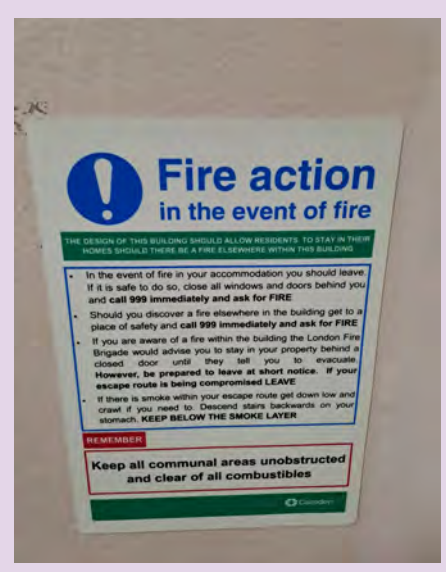
Fire Action Notices at Snowman House.