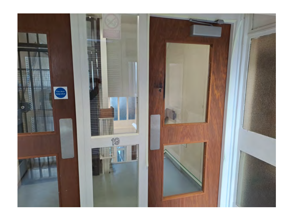
Communal Fire Doors at Snowman House.