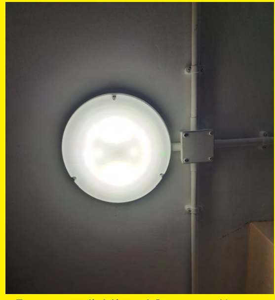
Emergency lighting at Snowman House.

Emergency lighting provides illumination in instances where mains power may have failed. It illuminates escape routes, emergency exit/s and firefighting equipment. It will provide illumination to signage and provide sufficient lighting to help you to escape.