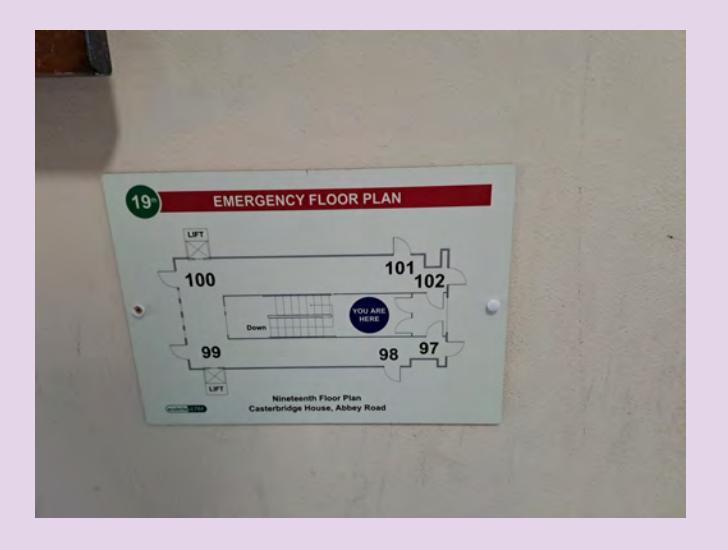
Wayfinding signage at Snowman.

Wayfinding signage is a visual communication tool to assist the Fire and Rescue Service in locating specific flats as they navigate their way round a building.