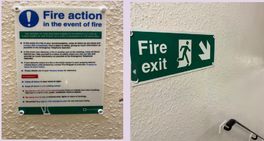
Fire Action Notices and Fire Exit Signs at Dorney.

We have installed Fire Action Notices and Fire Exit Signs in your building.