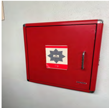
Secure Information Box at Dorney.

If you need help in the event of an emergency such as a fire, due to a physical disability or long term medical condition or another disorder please let us know