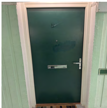
Front Entrance Door at Dorney.

In your building, fire doors lead to the communal hallway and stairwell. Doors for risers, electrical cupboards, and hatches are fire doors. Your front door may be a fire door.