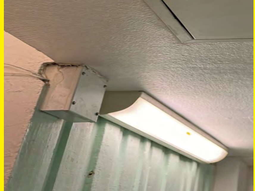
Emergency lighting at Dorney.

Emergency lighting provides illumination in instances where mains power may have failed. It illuminates escape routes, emergency exit/s and firefighting equipment. It will provide illumination to signage and provide sufficient lighting to help you to escape.