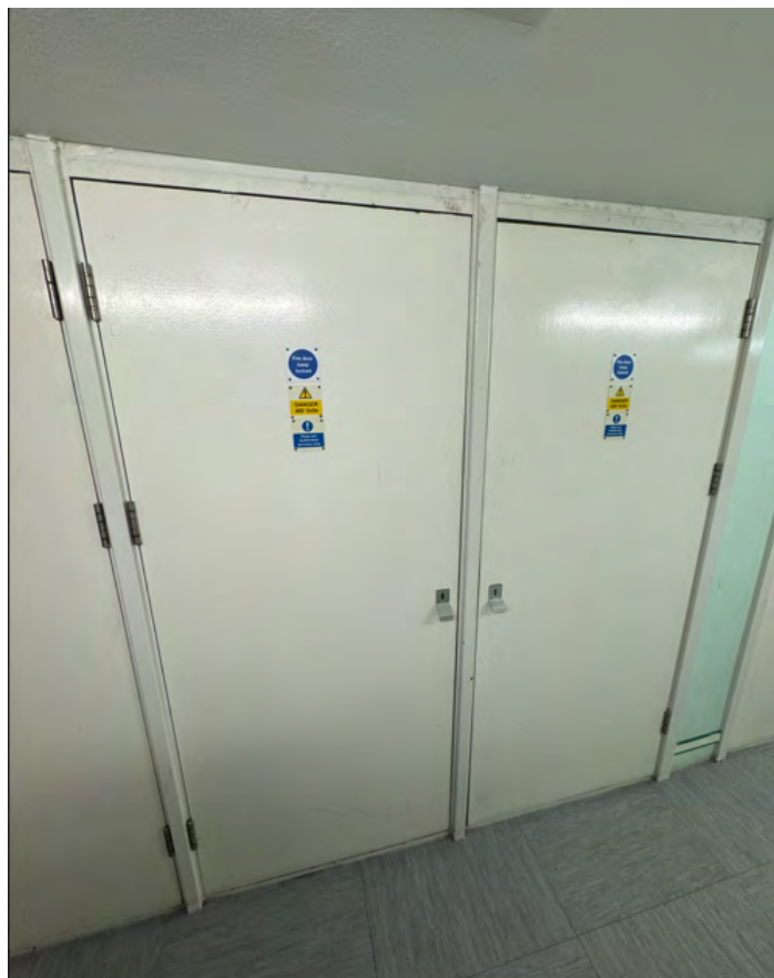
Service Riser Cupboard Fire Door at Dorney.

Doors to plant rooms, electrical intake and lift motor rooms (including fire rated hatches or panels)