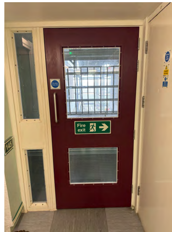
Communal area fire door at Dorney.