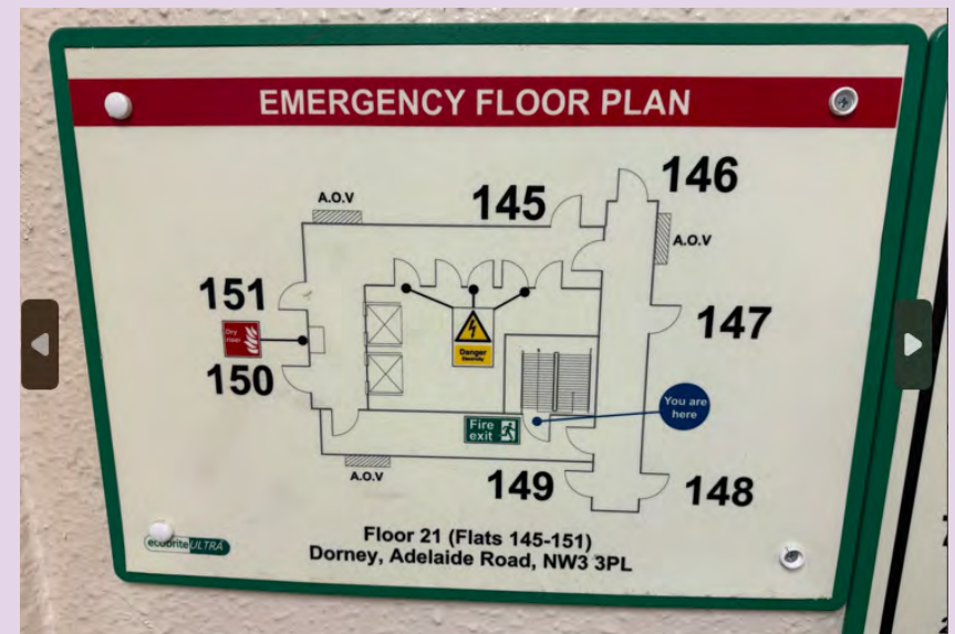
Wayfinding signage at Dorney.

Wayfinding signage is a visual communication tool to assist the Fire and Rescue Service in locating specific flats as they navigate their way round a building.