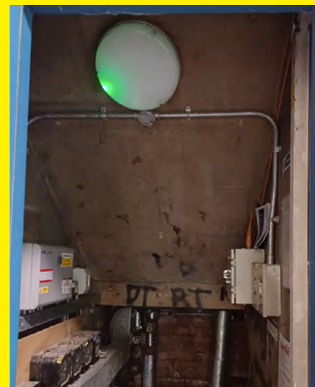
Emergency lighting at 3-15 and 19-32 The Chenies.

Emergency lighting provides illumination in instances where mains power may have failed. It illuminates escape routes, emergency exit/s and firefighting equipment. It will provide illumination to signage and provide sufficient lighting to help you to escape.