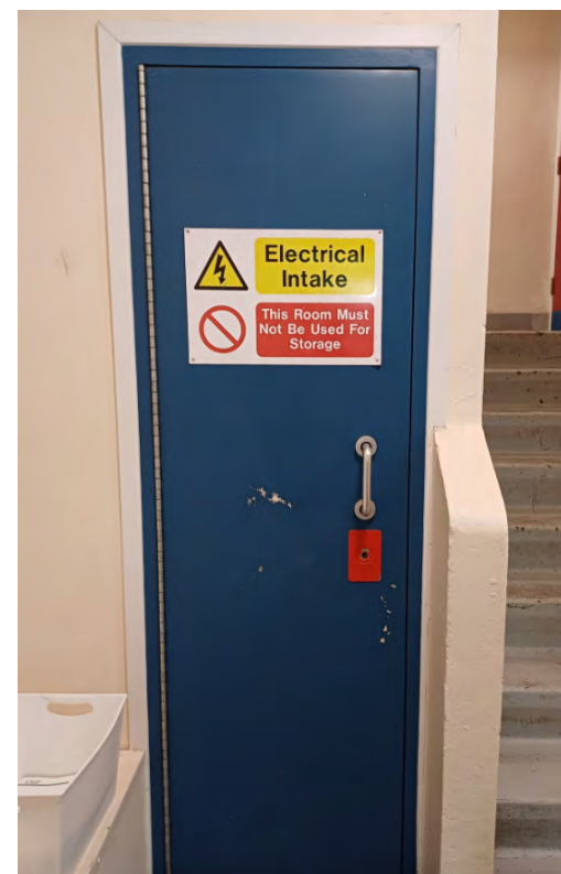
Communal Fire Door at 3-15 and 19-32 The Chenies.