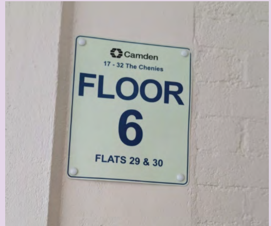
Wayfinding signage at 3-15 and 19-32 The Chenies

Wayfinding signage is a visual communication tool to assist the Fire and Rescue Service in locating specific flats as they navigate their way round a building.