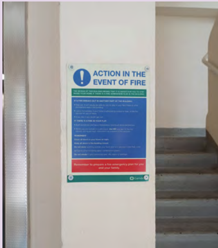
Fire Action Notice at 3-15 and 19-32 The Chenies.

We have installed Fire Action Notices in your building.