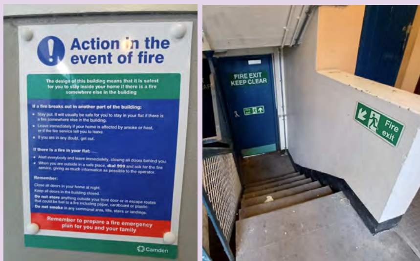
Fire action notice and Fire Exit Sign at Mullettsfield.

We have installed fire action notices and fire exit signs in your building.