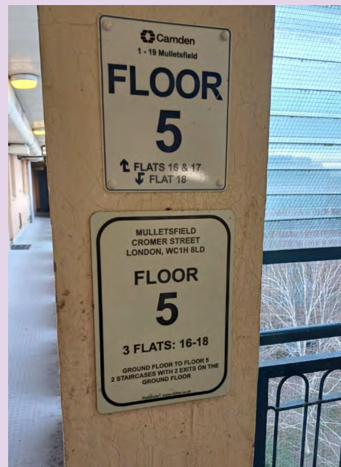
Various wayfinding signage at Mullettsfield.

Wayfinding signage is a visual communication tool to assist the Fire and Rescue Service in locating specific flats as they navigate their way round a building.