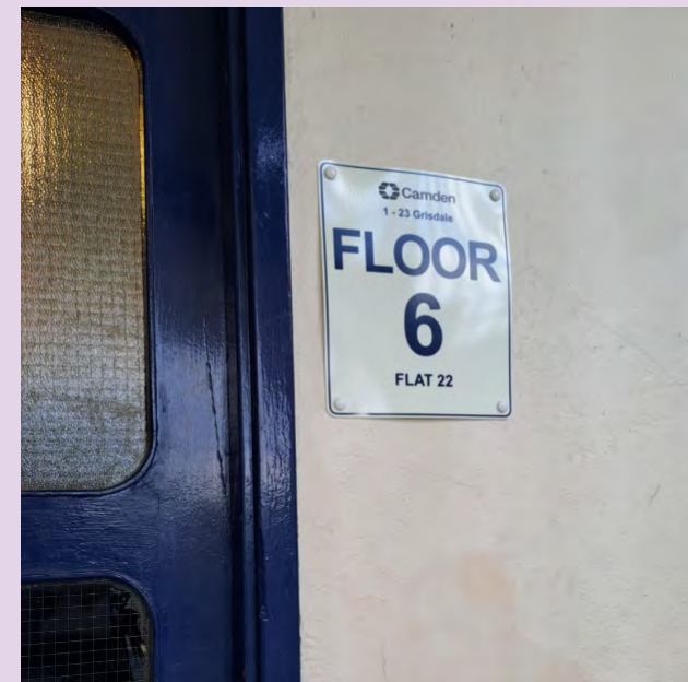
Wayfinding signage at 1-23 Grisedale.

Wayfinding signage is a visual communication tool to assist the Fire and Rescue Service in locating specific flats as they navigate their way round a building.