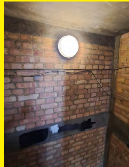
Emergency lighting at 1-23 Grisedale.

Emergency lighting provides illumination in instances where mains power may have failed. It illuminates escape routes, emergency exit/s and firefighting equipment. It will provide illumination to signage and provide sufficient lighting to help you to escape.