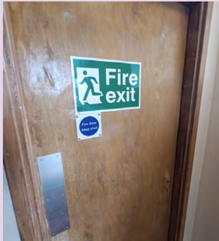
Fire Action Notice Fire Exit Sign at 1-23 Grisedale.