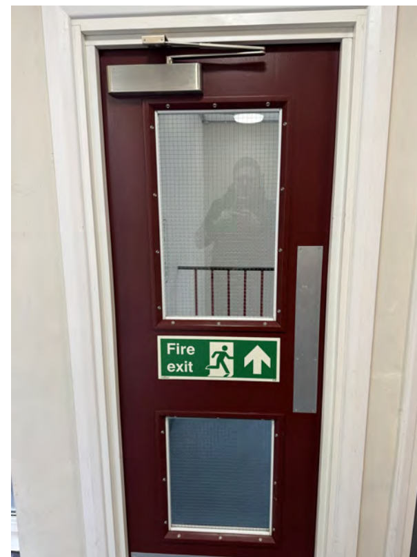
Communal door leading to stairwell at Falcon House.