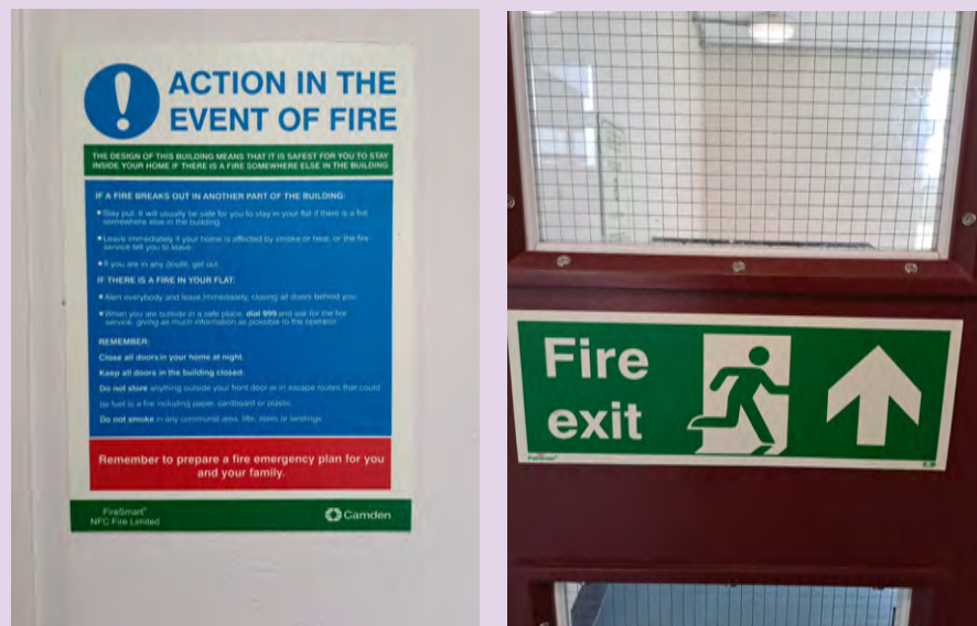
Fire action notice and fire exit signage at Falcon House.

We have installed fire action notices and fire exit signs in your building.