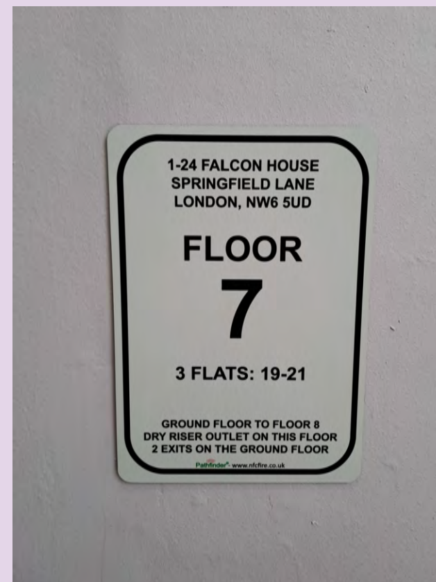
Wayfinding signage at Falcon House.

Wayfinding signage is a visual communication tool to assist the Fire and Rescue Service in locating specific flats as they navigate their way round a building.