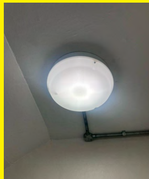
Emergency Lighting at Falcon House.

An emergency lighting system is generally comprised of self-contained 3hr battery back-up-maintained LED luminaires.