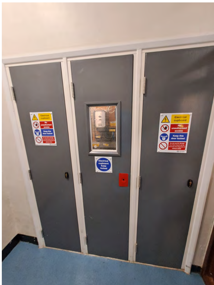
Electrical intake cupboard fire door at Falcon House.

Doors to plant rooms, electrical intake and lift motor rooms (including fire rated hatches or panels)