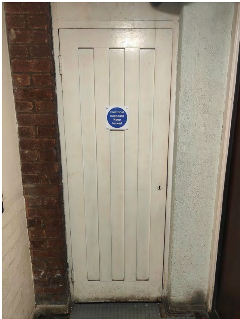
Electrical intake cupboard fire door at 1-24 Riverside.

Doors to plant rooms, electrical intake and lift motor rooms (including fire rated hatches or panels)