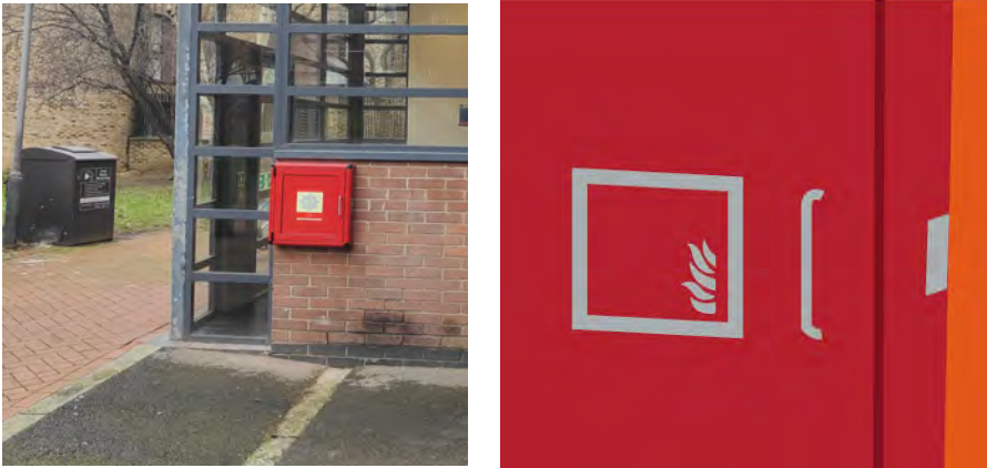
Secure Information Box at 1-25 Riverfleet.

Secure Information Boxes are easily identifiable storage units for documents intended for use by the fire and rescue service during a fire.