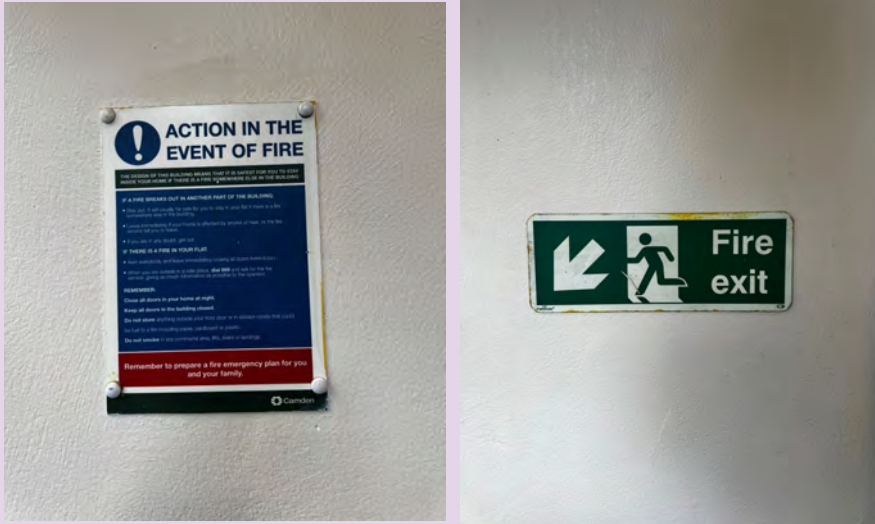
Fire action notice and fire exit sign at 1-25 Riverfleet.

We have installed fire action notices and fire exit signs in your building.