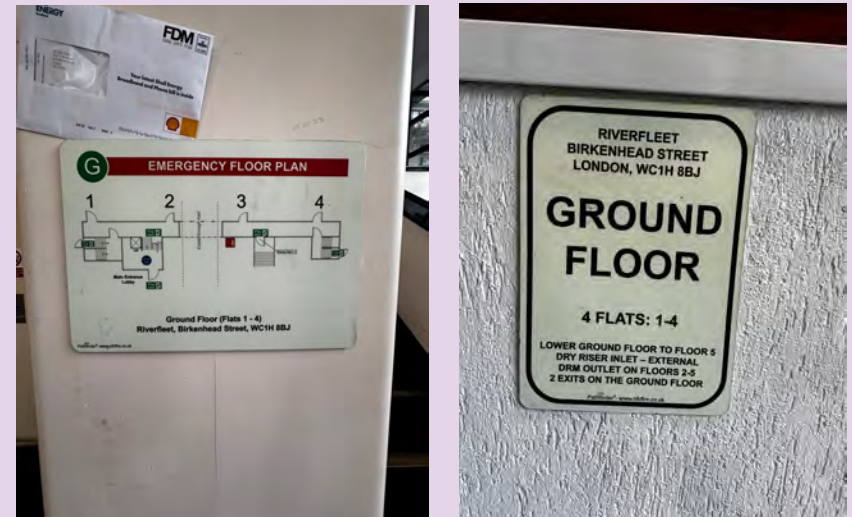
Various Wayfinding signage at 1-25 Riverfleet.

Wayfinding signage is a visual communication tool to assist the Fire and Rescue Service in locating specific flats as they navigate their way round a building.