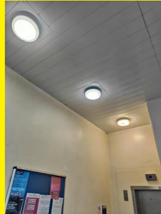
Emergency lighting at 1-25 Riverfleet.

Emergency lighting provides illumination in instances where mains power may have failed. It illuminates escape routes, emergency exit/s and firefighting equipment. It will provide illumination to signage and provide sufficient lighting to help you to escape.