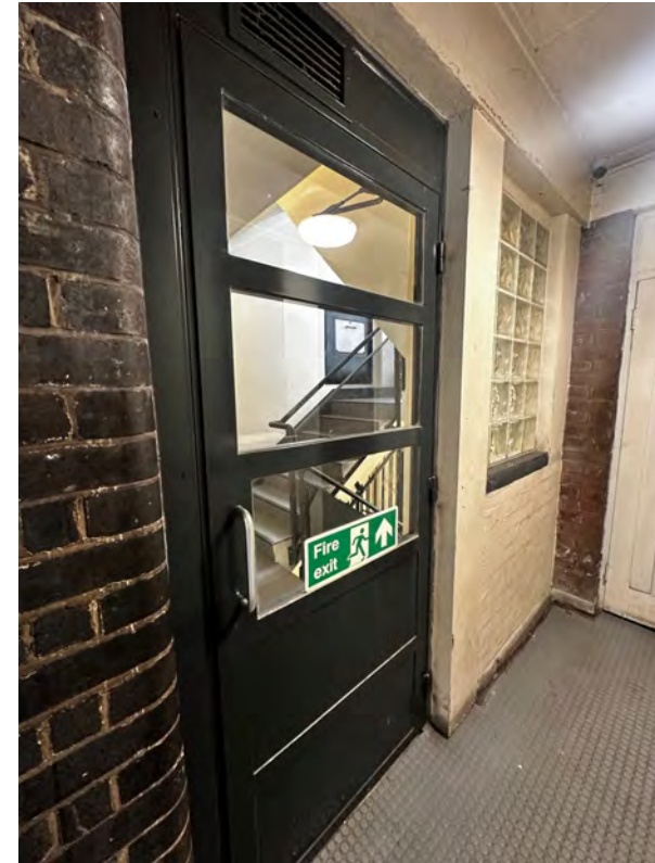
Communal Fire Door at 1-25 Riverfleet.