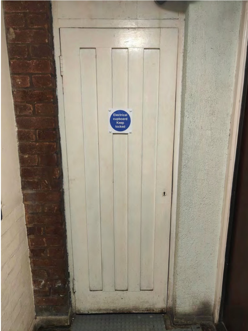
Electrical intake cupboard fire door at 1-25 Riverfleet.

Doors to plant rooms, electrical intake and lift motor rooms (including fire rated hatches or panels)