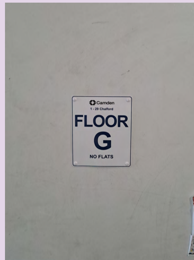
Wayfinding signage at 1-29 Chalford.

Wayfinding signage is a visual communication tool to assist the Fire and Rescue Service in locating specific flats as they navigate their way round a building.