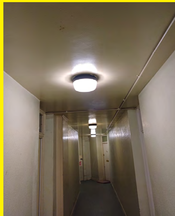
Emergency lighting at 1-29 Chalford.

The lighting should illuminate all escape routes, emergency exit/s and firefighting equipment.