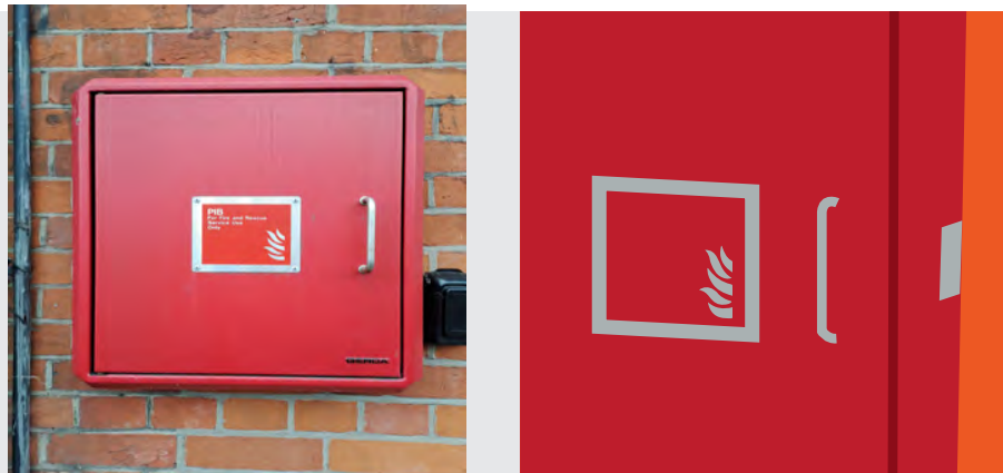
Secure Information Box at 1-29 Chalford.

Secure Information Boxes are easily identifiable storage units for documents intended for use by the fire and rescue service during a fire.