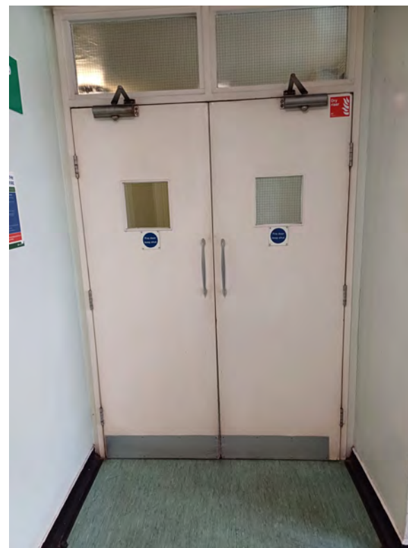
Communal Fire Door at 1-29 Chalford.