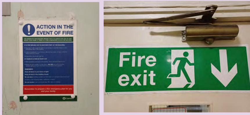
Fire Action Notice and Fire Exit Sign at 1-29 Chalford.

We have installed Fire Action Notices and Fire Exit Signs in your building.