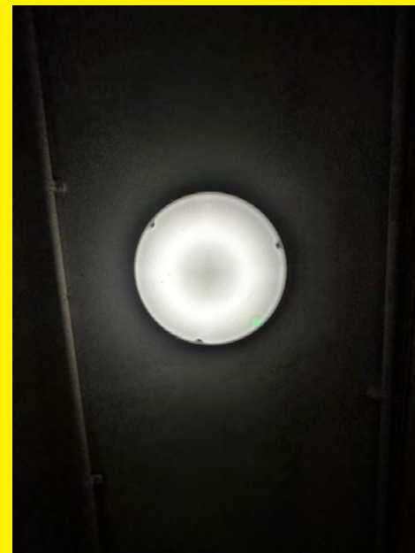
Emergency lighting at 1-30 Laystall Court.

Emergency lighting provides illumination in instances where mains power may have failed. It illuminates escape routes, emergency exit/s and firefighting equipment. It will provide illumination to signage and provide sufficient lighting to help you to escape.