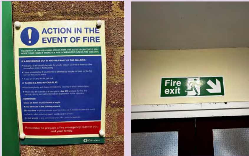
Fire Action Notice and Fire Exit Sign at 1-30 Laystall Court.

We have installed Fire Action Notices and Fire Exit Signs in your building.