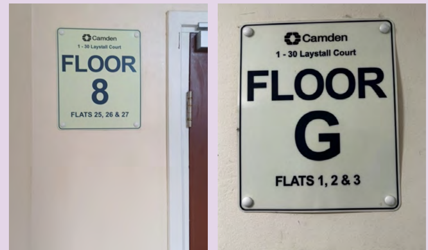
Wayfinding signage at 1-30 Laystall Court.

Wayfinding signage is a visual communication tool to assist the Fire and Rescue Service in locating specific flats as they navigate their way round a building.