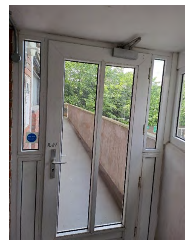
Fire door leading to stairwell lobby at 1-32 Ellerton House.