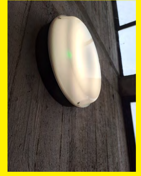
Emergency lighting at 1-32 Ellerton House.

Emergency lighting provides illumination in instances where mains power may have failed. It illuminates escape routes, emergency exit/ s and firefighting equipment. It will provide illumination to signage and provide sufficient lighting to help you to escape.