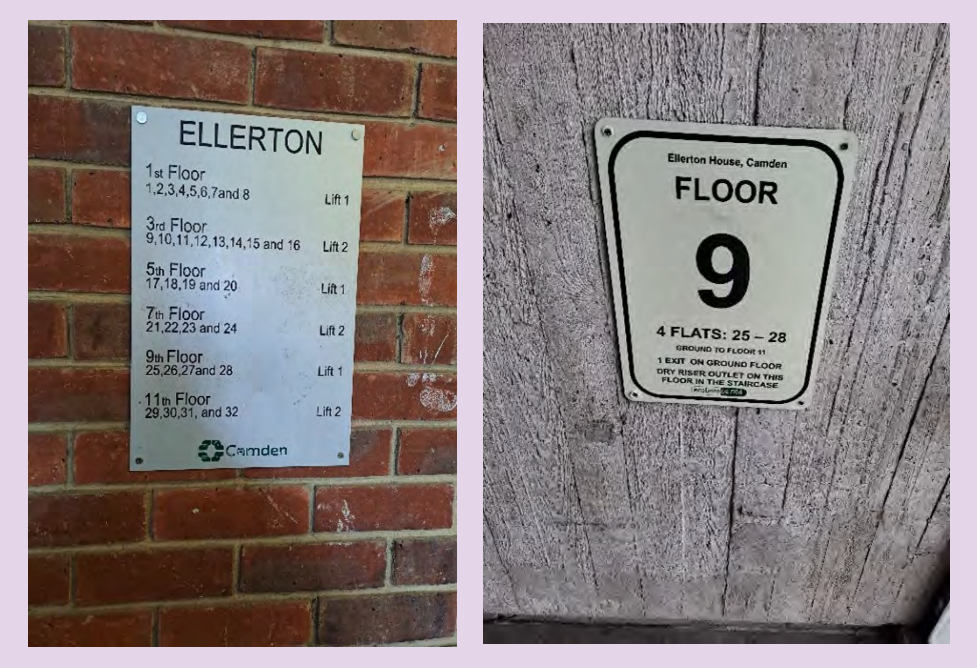
Wayfinding signage in various locations at 1-32 Ellerton House.

Wayfinding signage is a visual communication tool to assist the Fire and Rescue Service in locating specific flats as they navigate their way round a building.