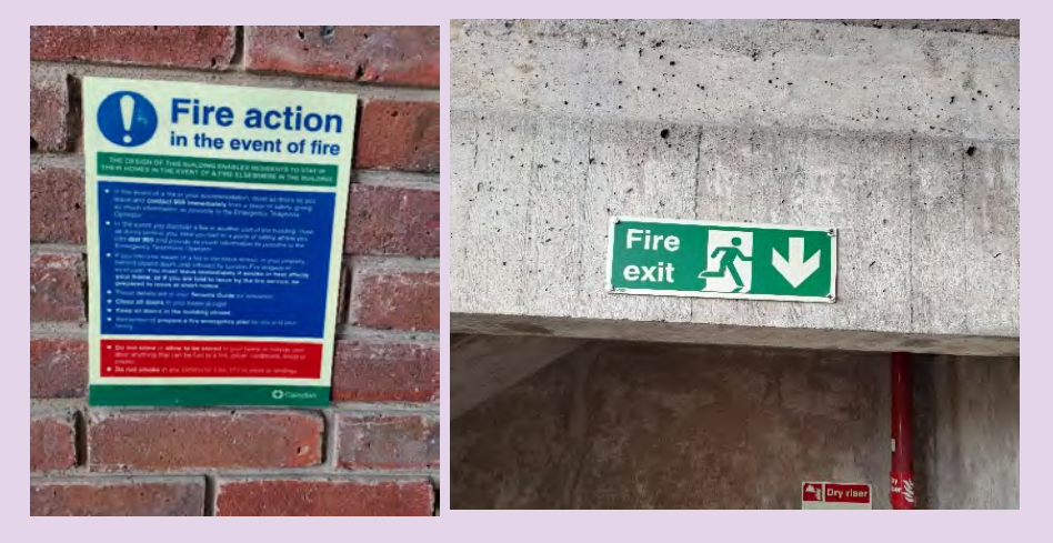
Fire Action Notice and Fire Exit Sign at 1-32 Ellerton House

We have installed Fire Action Notices and Fire Exit Signs in your building.