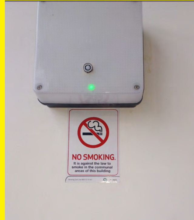
Emergency lighting and No Smoking sign at 1-32 Lindale.

Emergency lighting provides illumination in instances where mains power may have failed. It illuminates escape routes, emergency exit/s and firefighting equipment. It will provide illumination to signage and provide sufficient lighting to help you to escape.