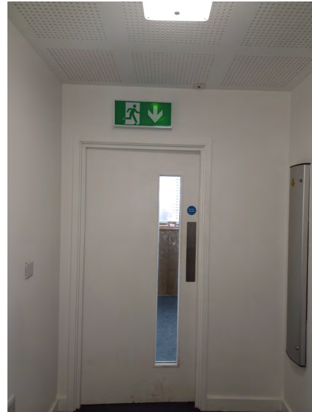
Communal Fire Door at 1-32 Lindale.