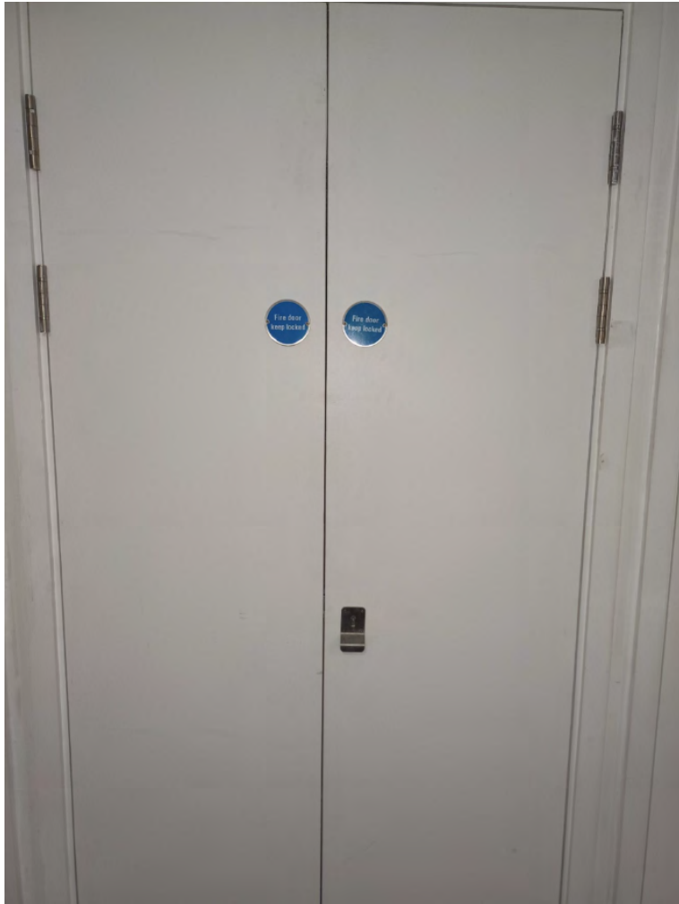
Cupboard with Fire Doors at 1-32 Lindale.

Doors to plant rooms, electrical intake and lift motor rooms (including fire rated hatches or panels)