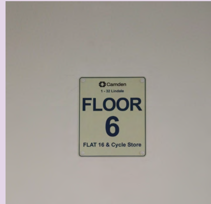
Wayfinding signage at 1-32 Lindale.

Wayfinding signage is a visual communication tool to assist the Fire and Rescue Service in locating specific flats as they navigate their way round a building.