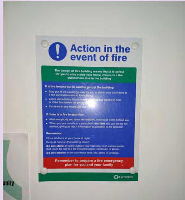
Fire Action Notice at 1-32 Lindale.

We have installed Fire Action Notices and Fire Exit Signs in your building.