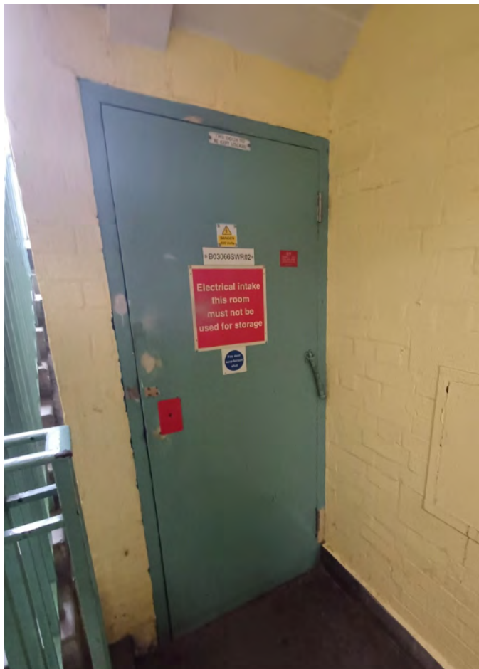
Electrical Intake Room Fire Door at 1-32 Warnham.

Doors to plant rooms, electrical intake and lift motor rooms (including fire rated hatches or panels)