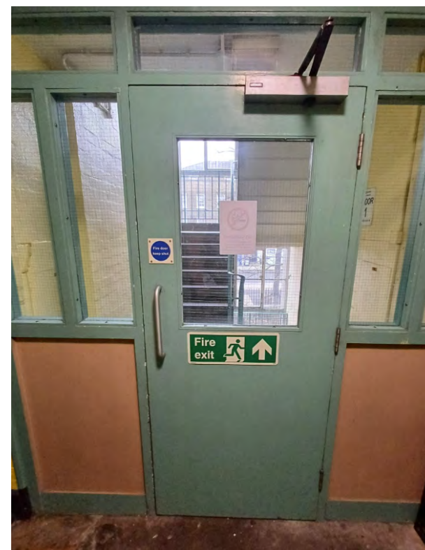
Communal Fire Door at 1-32 Warnham.