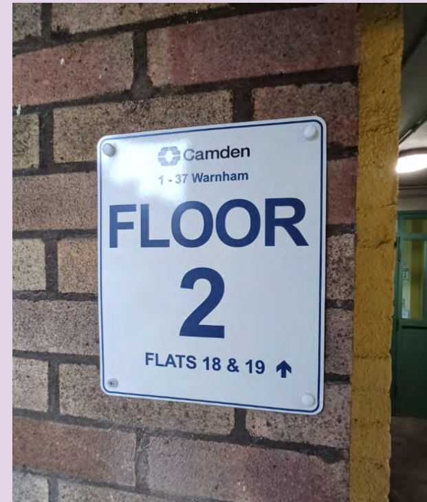
Wayfinding signage at 1-32 Warnham

Wayfinding signage is a visual communication tool to assist the Fire and Rescue Service in locating specific flats as they navigate their way round a building.