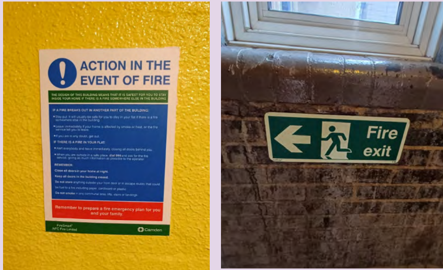
Fire Action Notice at 1-32 Warnham.

We have installed Fire Action Notices and Fire Exit Signs in your building.