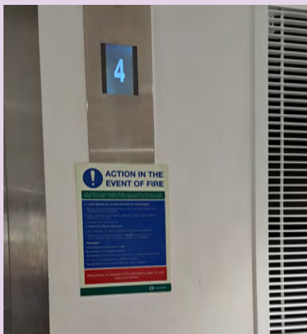
Fire Action Notice at 1-34 Winchester Apartments beside the lift.

We have installed Fire Action Notices and Fire Exit signs in your building.