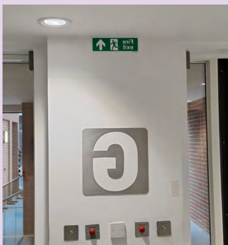
Fire Exit signage at 1-34 Winchester Apartments