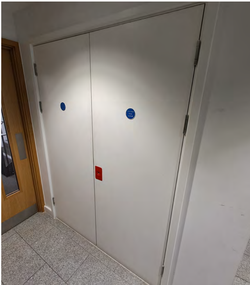
Service Riser Cupboard Fire Door at 1-34 Winchester Apartments.

Doors to plant rooms, electrical intake and lift motor rooms (including fire rated hatches or panels)