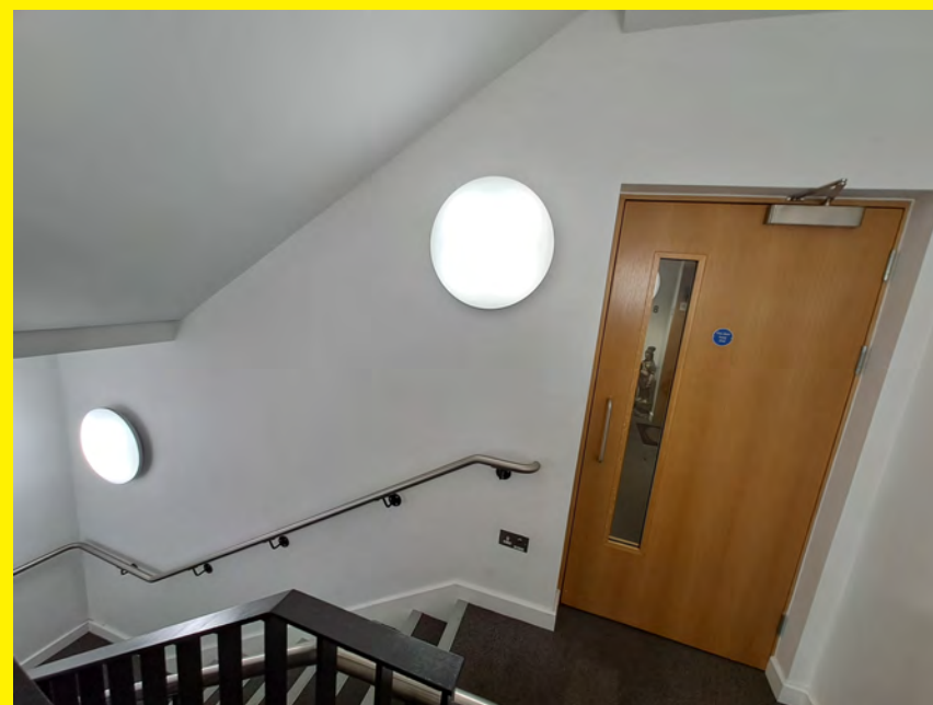
Stairwell emergency lighting 1-34 Winchester Apartments.

An emergency lighting system is generally comprised of self-contained 3hr battery back-up-maintained LED luminaires.