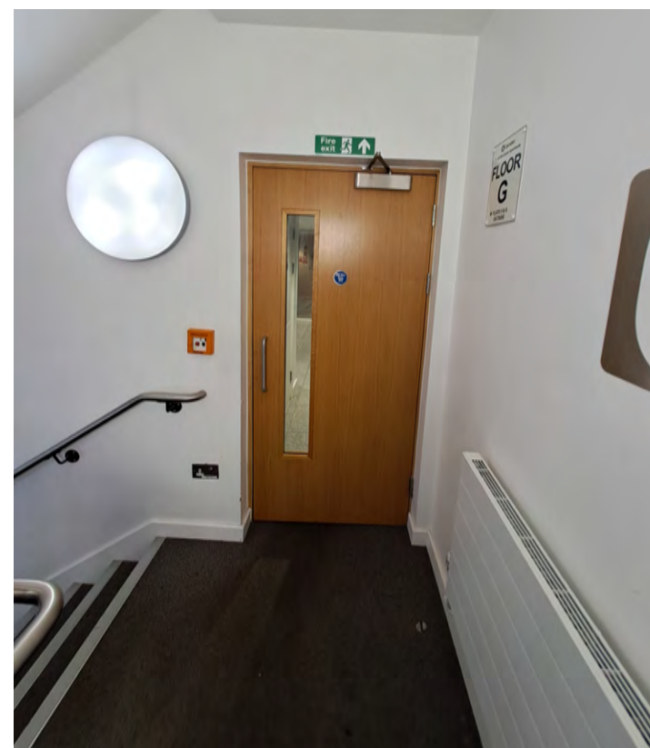
Communal Fire Door at 1-34 Winchester Apartments.