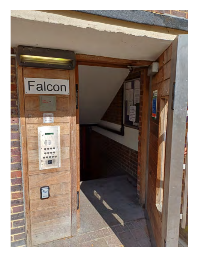
Communal Fire door at 1-42 Falcon.