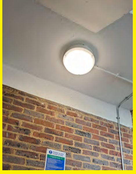
Emergency lighting at 1-42 Falcon.

Emergency lighting at 1-42 Falcon is located on walkways and in staircases.