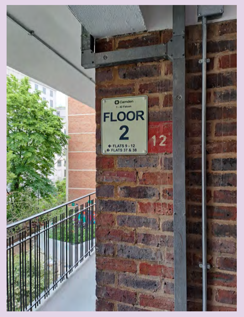
Wayfinding signage at Falcon.

Wayfinding signage is a visual communication tool to assist the Fire and Rescue Service in locating specific flats as they navigate their way round a building.