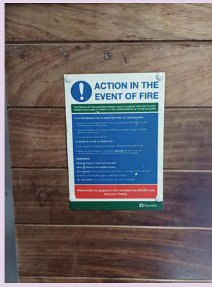
Fire Action Notices at 1-42 Falcon.