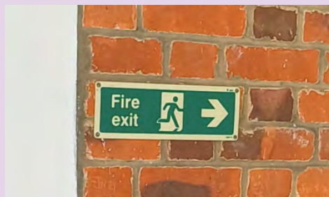
Fire Action Notice and Fire Exit Sign at 1-42 Windmill.