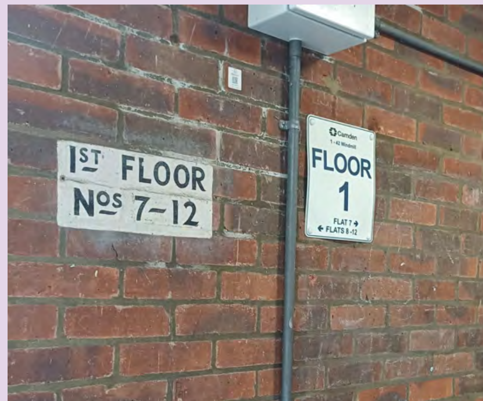
Wayfinding signage at 1-42 Windmill.

Wayfinding signage is a visual communication tool to assist the Fire and Rescue Service in locating specific flats as they navigate their way round a building.