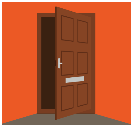
Front Entrance Door at 1-42 Windmill.