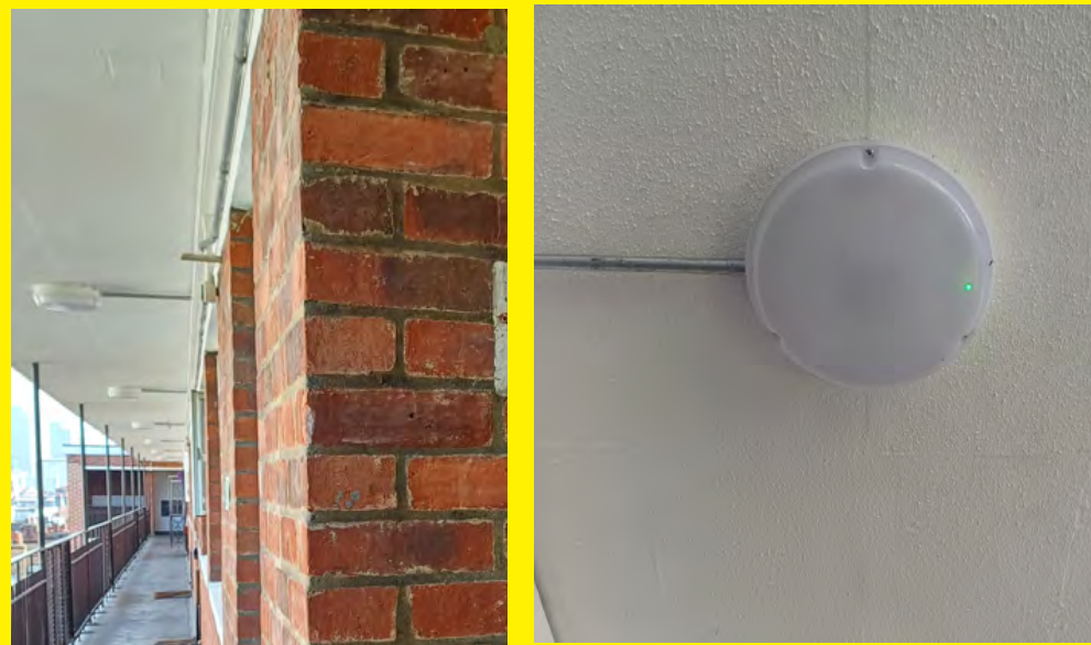
Emergency lighting at 1-42 Windmill.

An emergency lighting system is generally comprised of self-contained 3hr battery back-up-maintained LED luminaires.