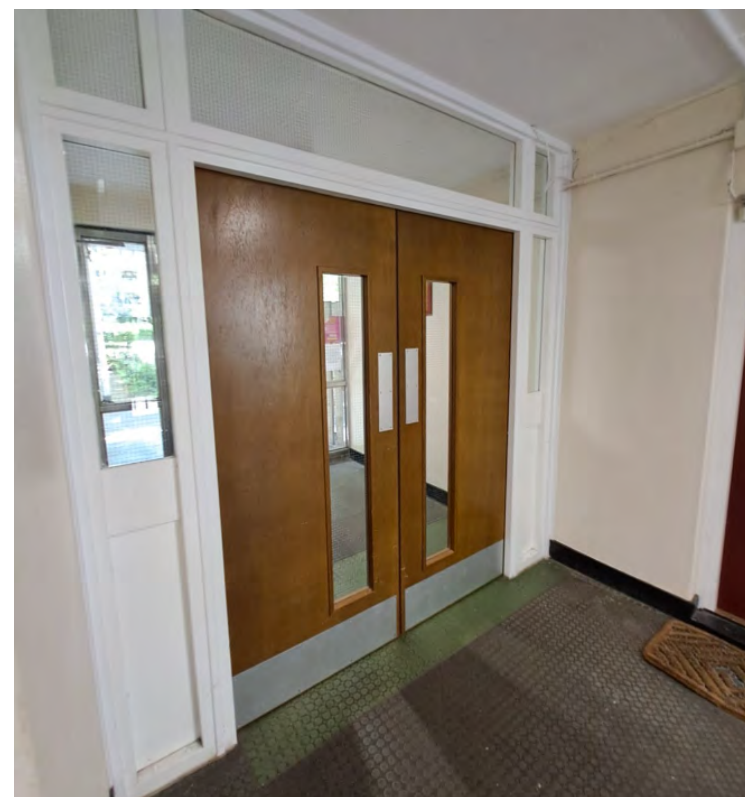
Communal fire door at 1-44 Derwent Robert Street.