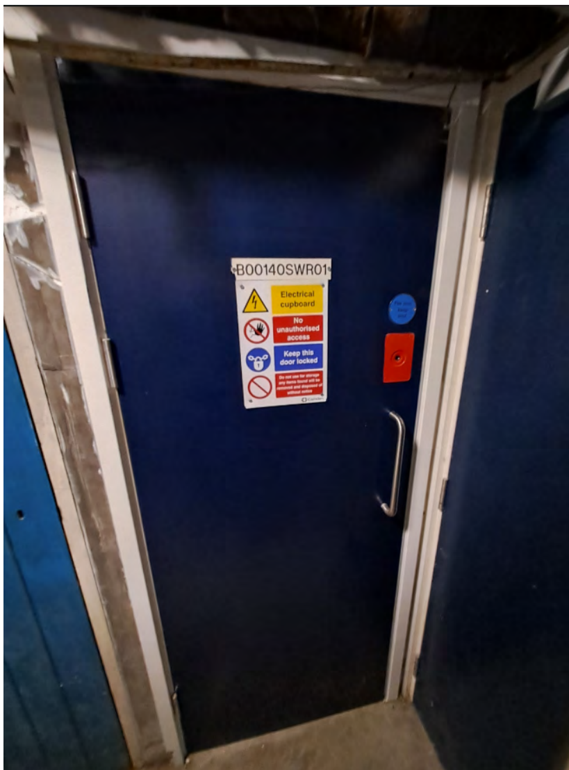
Electrical intake cupboard fire door at 1-44 Derwent Robert Street.

Doors to plant rooms, electrical intake and lift motor rooms (including fire rated hatches or panels)