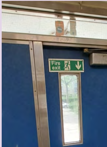
Fire Action Notice and Fire Exit Sign at 1-44 Derwent Robert Street .