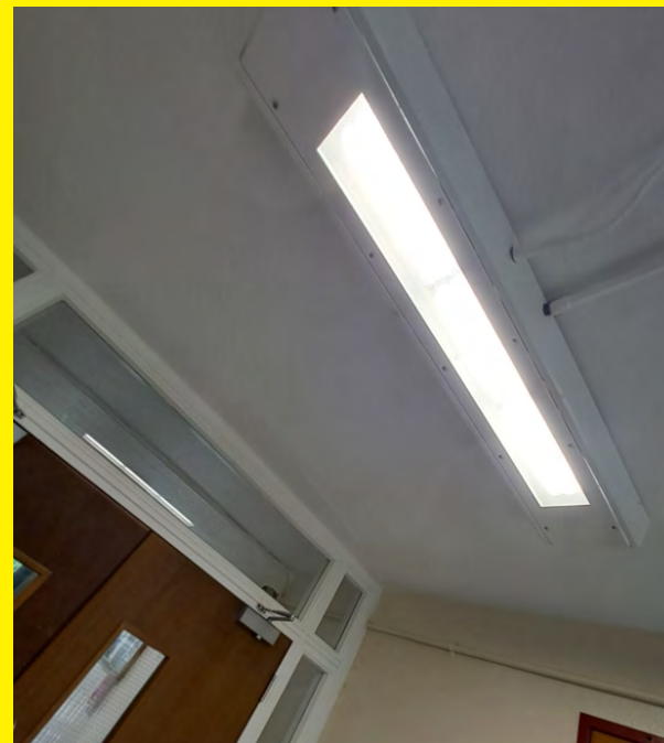
Emergency lighting at 1-44 Derwent Robert Street

Emergency lighting provides illumination in instances where mains power may have failed. It illuminates escape routes, emergency exit/s and firefighting equipment. It will provide illumination to signage and provide sufficient lighting to help you to escape.