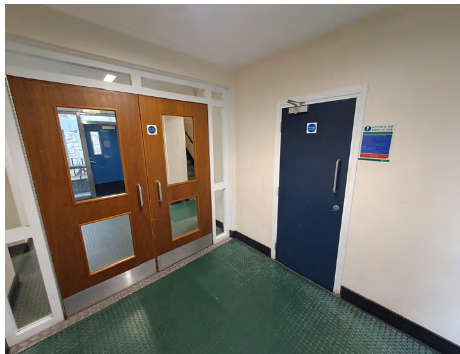
Communal Fire Doors at 1-44 Patterdale.