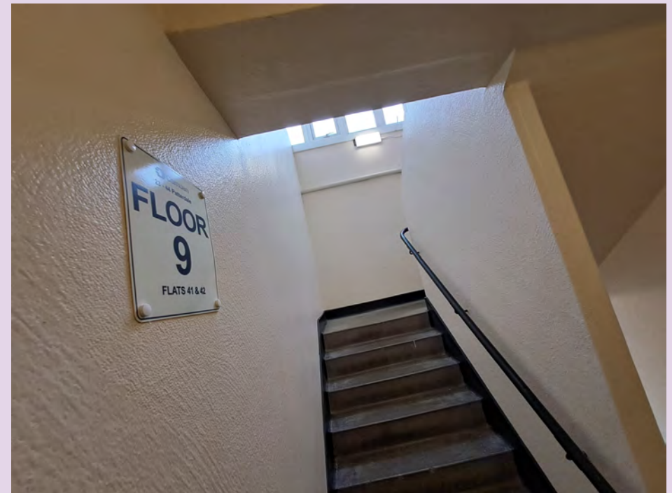
Wayfinding signage in stairwell at 1-44 Patterdale.

Wayfinding signage is a visual communication tool to assist the Fire and Rescue Service in locating specific flats as they navigate their way round a building.