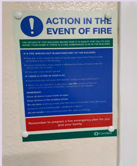
Fire Action Notice at 1-44 Patterdale.

We have installed Fire Action Notices in your building.