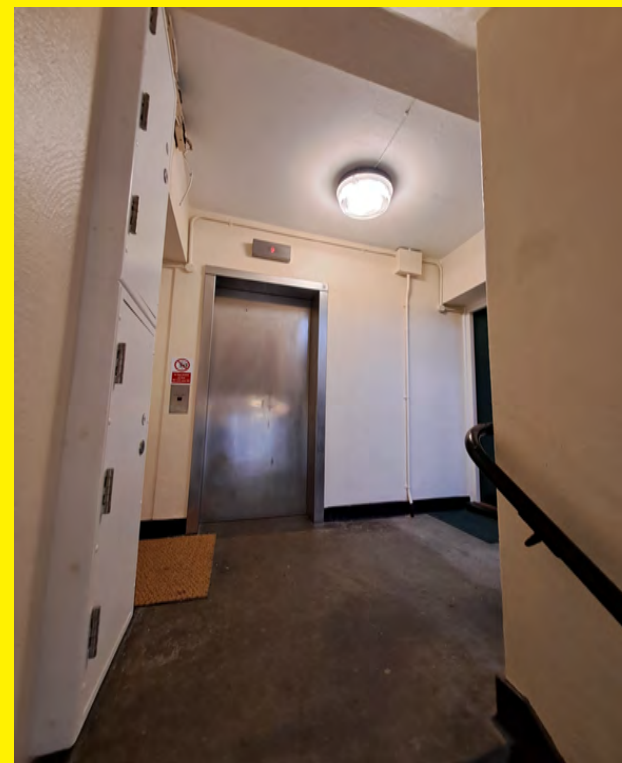
Emergency lighting at Patterdale.

Emergency lighting provides illumination in instances where mains power may have failed. It illuminates escape routes, emergency exit/s and firefighting equipment. It will provide illumination to signage and provide sufficient lighting to help you to escape.