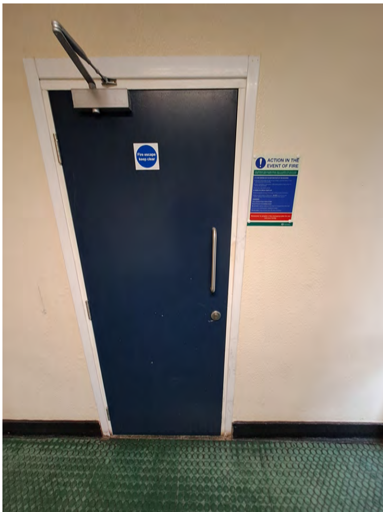
Electrical Cupboard Fire Door at 1-44 Patterdale.

Doors to plant rooms, electrical intake and lift motor rooms (including fire rated hatches or panels)