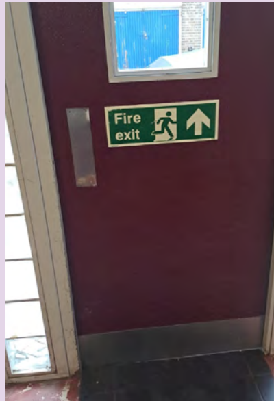
Fire Action Notice and Fire Exit Signs at 1-54 Farjeon House.