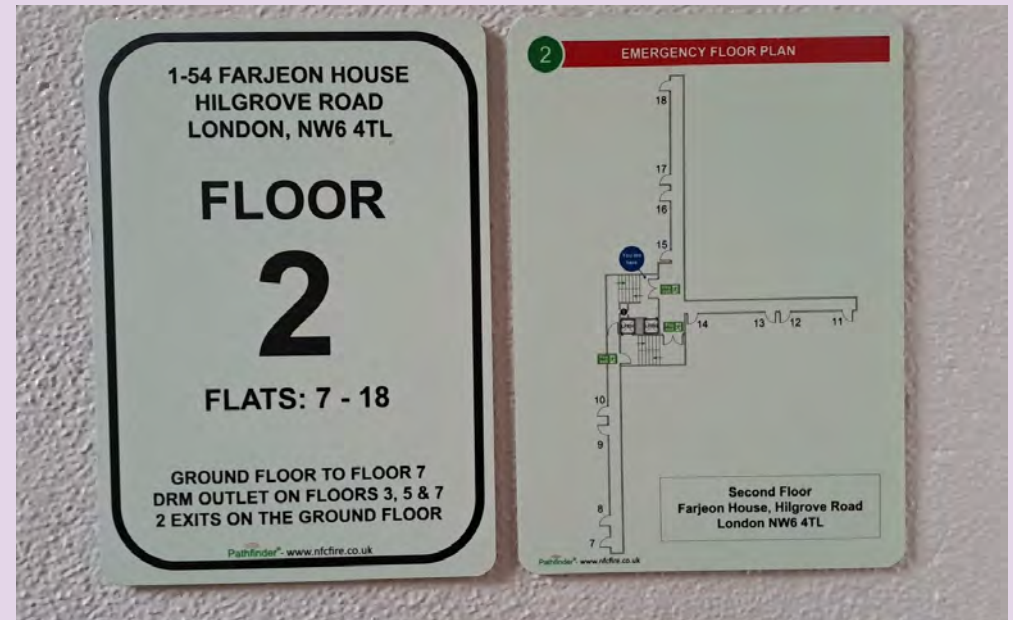
Wayfinding signage at 1-54 Farjeon House.

Wayfinding signage is a visual communication tool to assist the Fire and Rescue Service in locating specific flats as they navigate their way round a building.