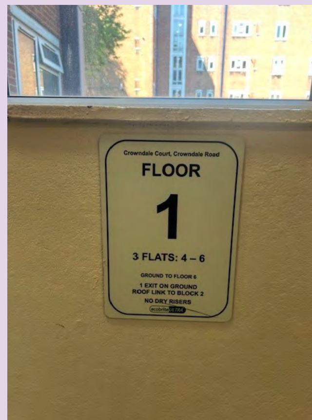
First floor Wayfinding signage at Crowndale Court.

Wayfinding signage is a visual communication tool to assist the Fire and Rescue Service in locating specific flats as they navigate their way round a building.