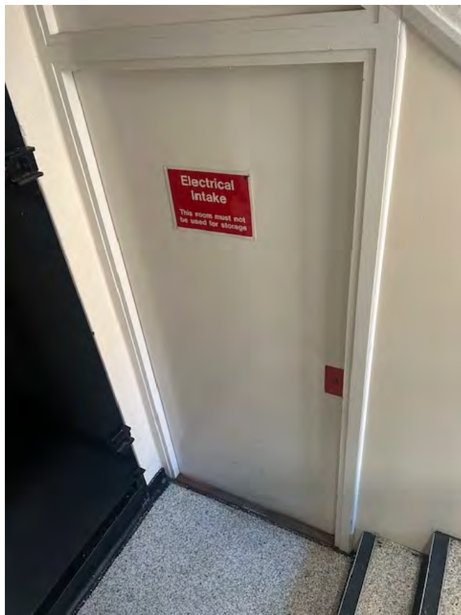
Electrical Intake Cupboard Fire Door at Crowndale Court.