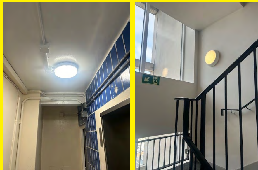
Emergency lighting at Crowndale Court.

An emergency lighting system is generally comprised of self-contained 3hr battery back-up-maintained LED luminaires.