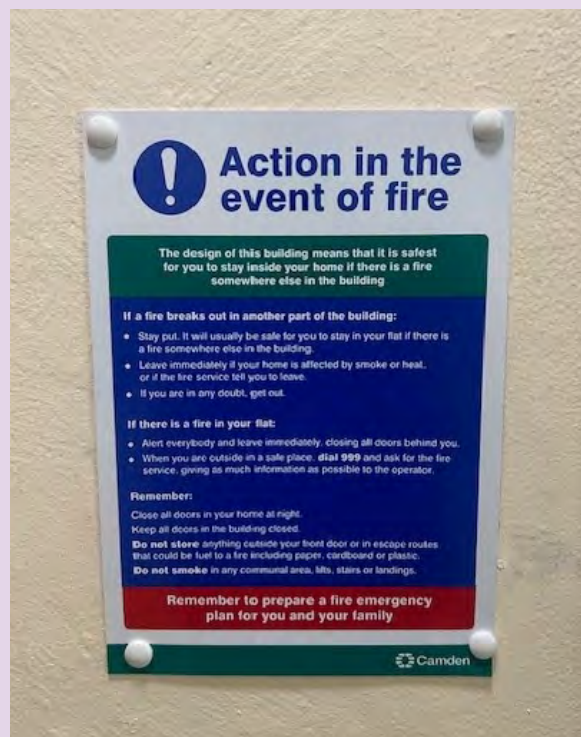
Fire Action Notice at Crowndale Court.

We have installed Fire Action Notices and Fire Exit Signs in your building.