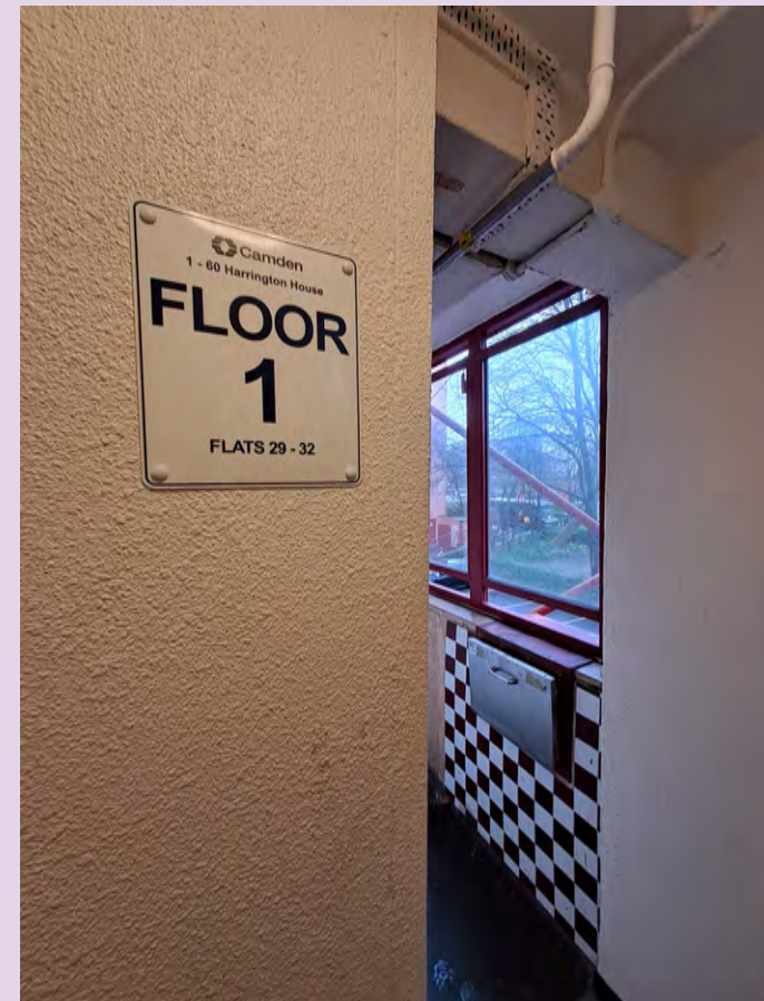
First floor wayfinding signage at Harrington House.

Wayfinding signage is a visual communication tool to assist the Fire and Rescue Service in locating specific flats as they navigate their way round a building.