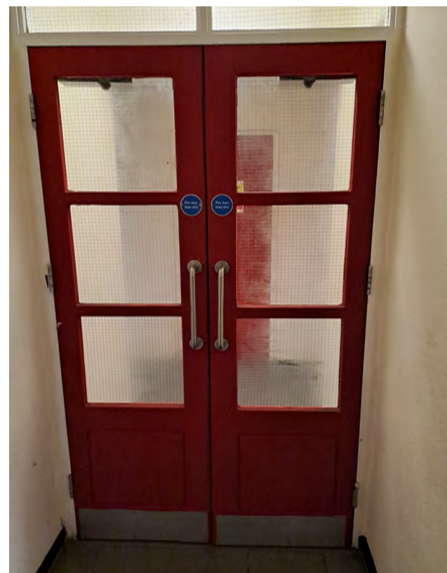
Communal Fire Door at Harrington House.