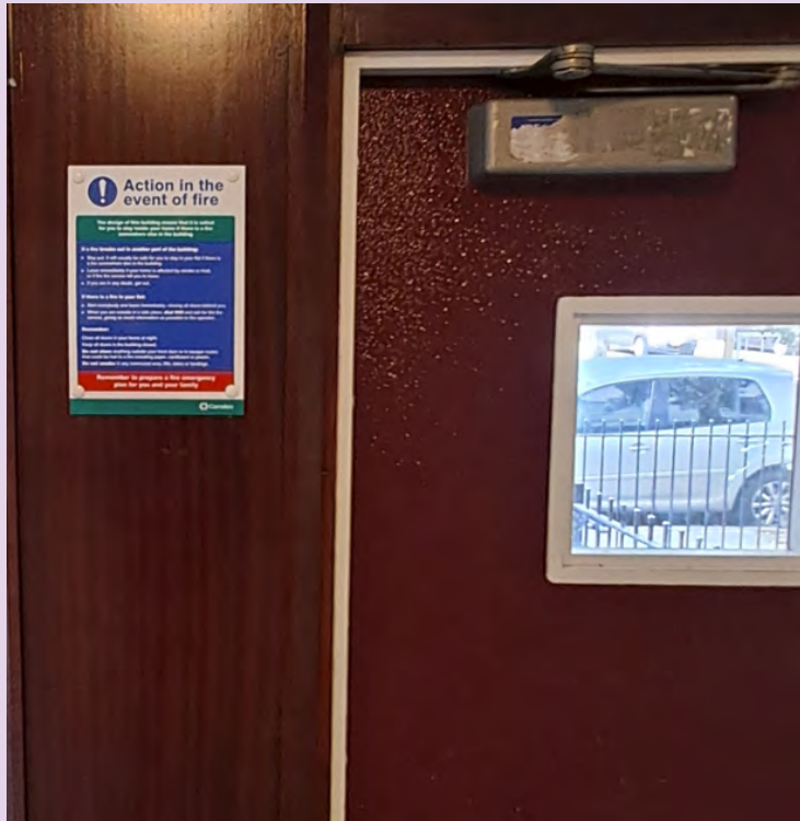
Fire Action Notice at Harrington House.

We have installed Fire Action Notices and Fire Exit Signs in your building.