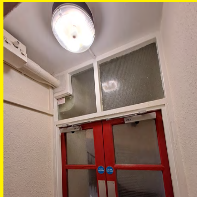
Emergency lighting in the communal area at Harrington House.

Emergency lighting provides illumination in instances where mains power may have failed. It illuminates escape routes, emergency exit/s and firefighting equipment. It will provide illumination to signage and provide sufficient lighting to help you to escape.