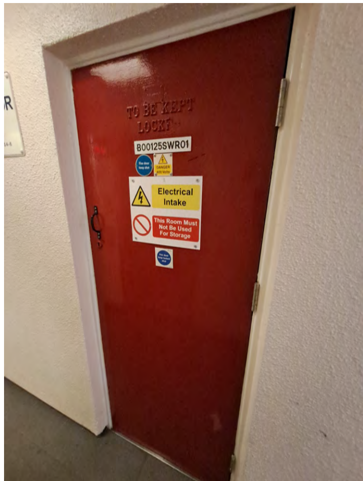
Electrical intake cupboard at Harrington House.

Doors to plant rooms, electrical intake and lift motor rooms (including fire rated hatches or panels)