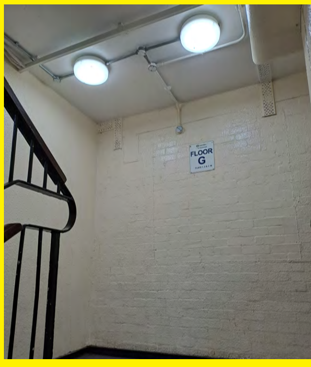
Emergency lighting in the stairwell at Hawkshead.

Emergency lighting provides illumination in instances where mains power may have failed. It illuminates escape routes, emergency exit/s and firefighting equipment. It will provide illumination to signage and provide sufficient lighting to help you to escape.