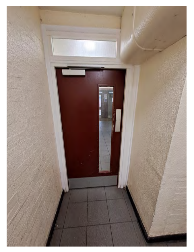
Communal area fire door leading to lobby at Hawkshead.