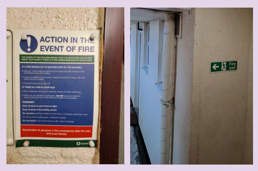
Fire Action Notice and Fire Exit Sign at Hawkshead.

We have installed Fire Action Notices and Fire Exit Signs in your building.