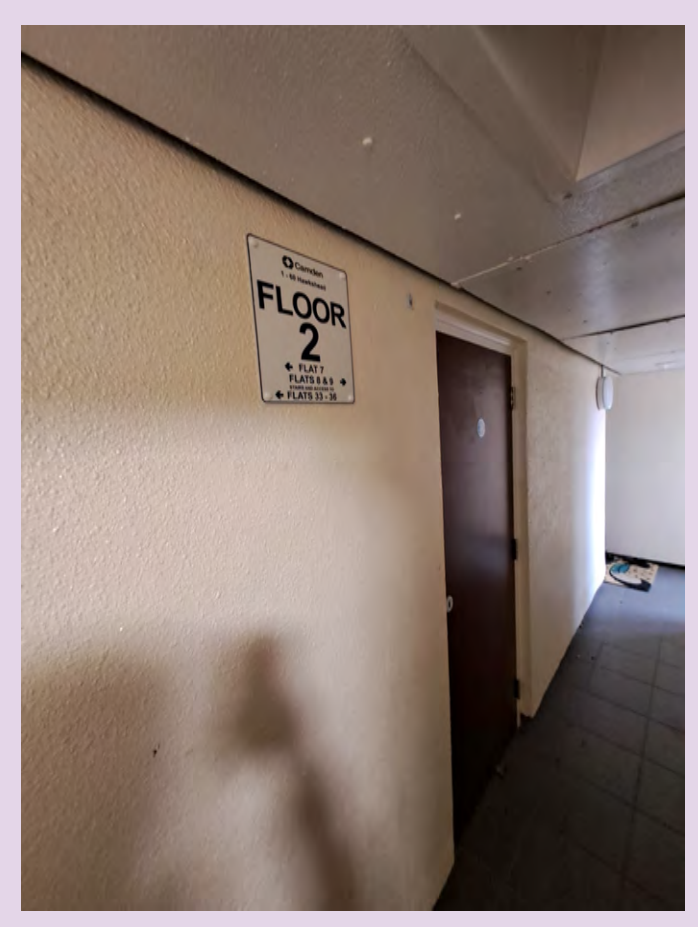
Wayfinding signage in communal area Hawkshead.

Wayfinding signage is a visual communication tool to assist the Fire and Rescue Service in locating specific flats as they navigate their way round a building.