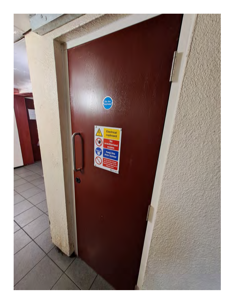
Electrical intake cupboard at Hawkshead.