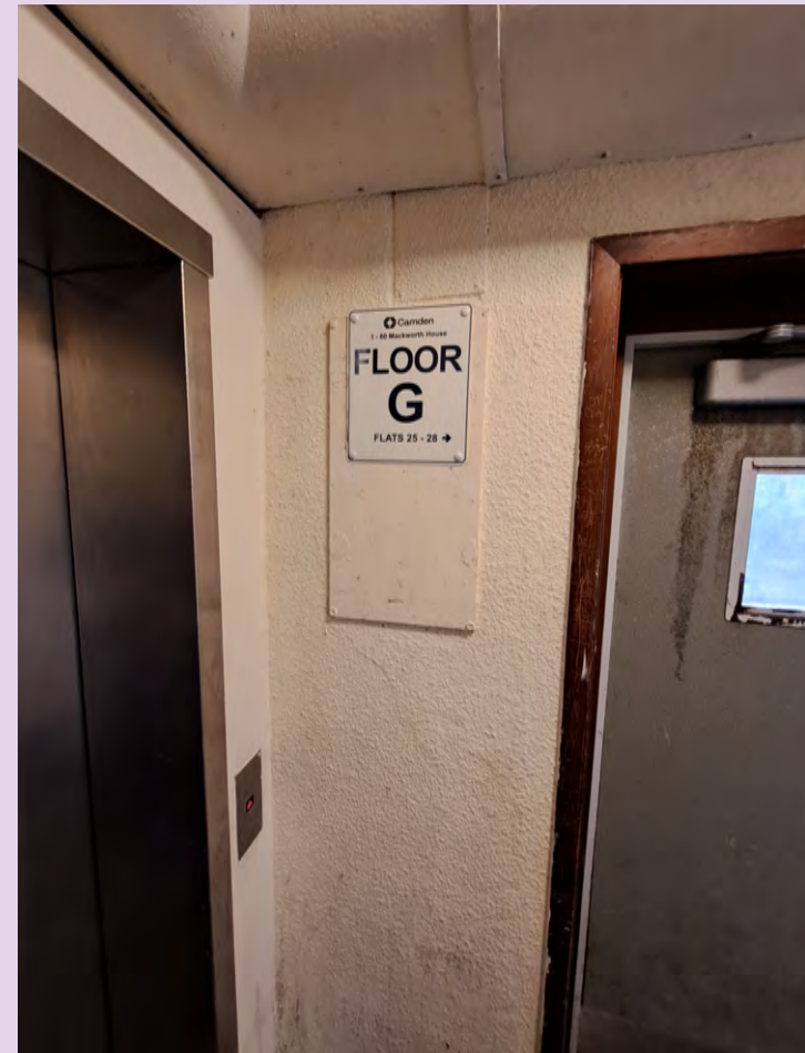
Wayfinding signage at Mackworth House.

Wayfinding signage is a visual communication tool to assist the Fire and Rescue Service in locating specific flats as they navigate their way round a building