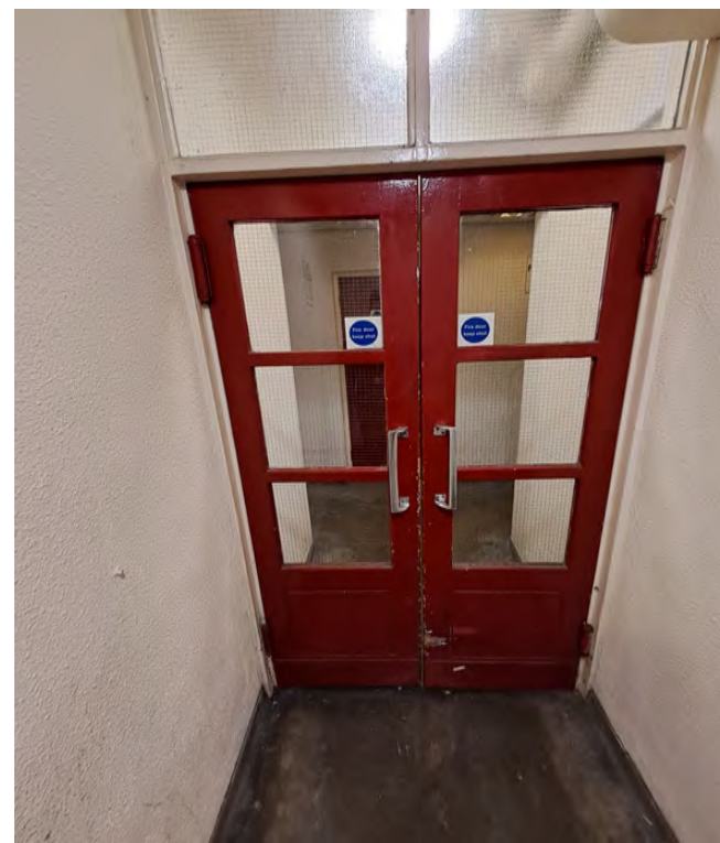
Communal Fire Door leading to the stairwell at Mackworth House.