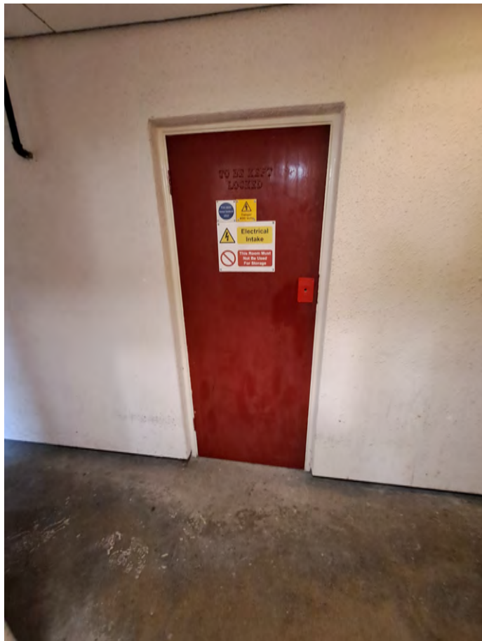
Electrical intake cupboard at Mackworth House.

Doors to plant rooms, electrical intake and lift motor rooms (including fire rated hatches or panels)