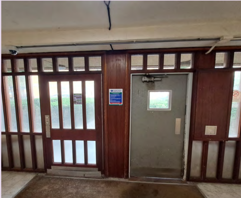
Fire Action Notice on the ground floor at main entrance at Mackworth House.

We have installed Fire Action Notices and Fire Exit Signs in your building.