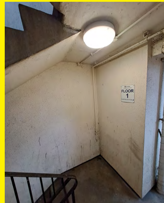
Emergency lighting in the stairwell at Mackworth House.

Emergency lighting provides illumination in instances where mains power may have failed. It illuminates escape routes, emergency exit/s and firefighting equipment. It will provide illumination to signage and provide sufficient lighting to help you to escape.