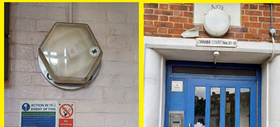
Emergency lighting at 1-62 Lorraine Court.

Emergency lighting provides illumination in instances where mains power may have failed. It illuminates escape routes, emergency exit/s and firefighting equipment. It will provide illumination to signage and provide sufficient lighting to help you to escape.