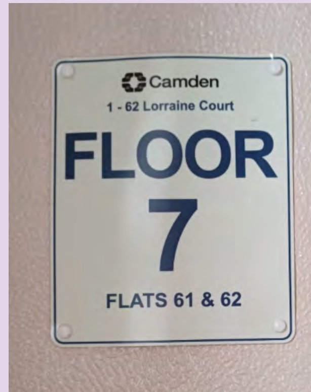
Wayfinding signage at 1-62 Lorraine Court

Wayfinding signage is a visual communication tool to assist the Fire and Rescue Service in locating specific flats as they navigate their way round a building.