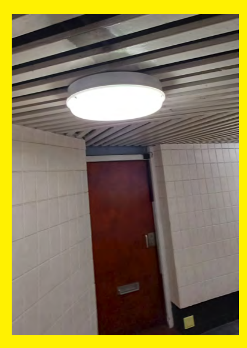
Emergency lighting at Seymour House.

Emergency lighting provides illumination in instances where mains power may have failed. It illuminates escape routes, emergency exit/s and firefighting equipment. It will provide illumination to signage and provide sufficient lighting to help you to escape.