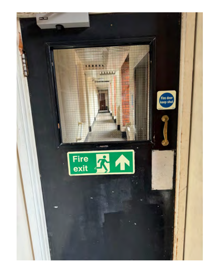
Communal Fire Door at Seymour House.