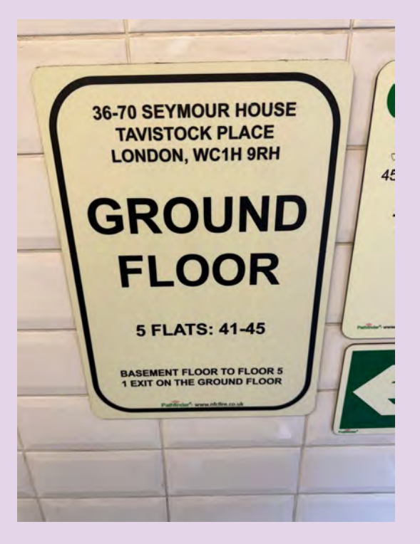
Wayfinding signage at Seymour House

Wayfinding signage is a visual communication tool to assist the Fire and Rescue Service in locating specific flats as they navigate their way round a building.