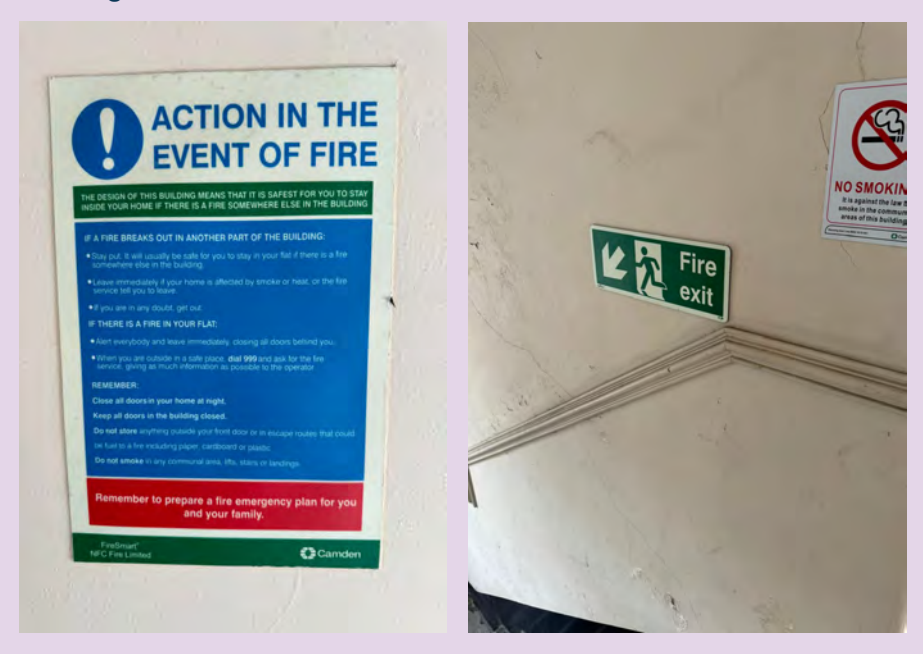
Fire Action Notice and Fire Exit Sign at Seymour House.

We have installed Fire Action Notices and Fire Exit Signs in your building.