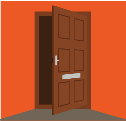
Front Entrance Door at Seymour House.