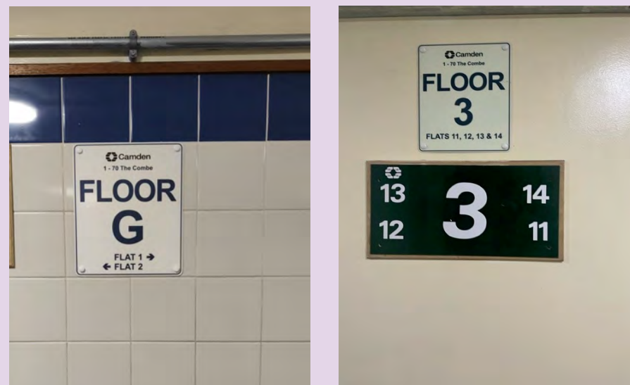
Wayfinding signage at The Combe.

Wayfinding signage is a visual communication tool to assist the Fire and Rescue Service in locating specific flats as they navigate their way round a building.