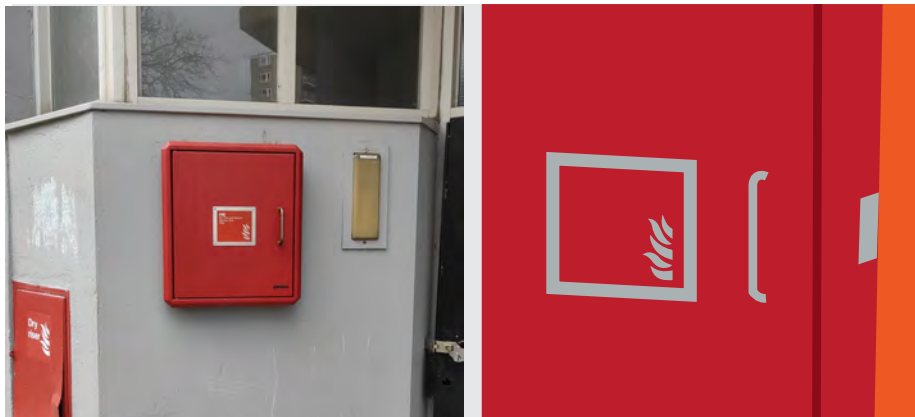
Secure Information Box at The Combe.

Secure Information Boxes are easily identifiable storage units for documents intended for use by the fire and rescue service during a fire.