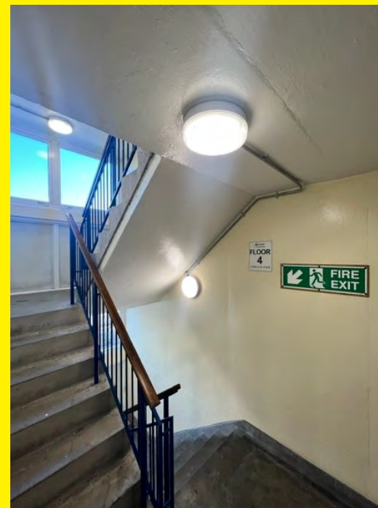
Emergency lighting at The Combe.

An emergency lighting system is generally comprised of self-contained 3hr battery back-up-maintained LED luminaires.