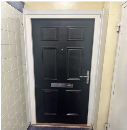
Front Entrance Doors at The Combe.

In your building, the communal doors leading to staircases on each floor are fire doors. Your front door may be a fire door.