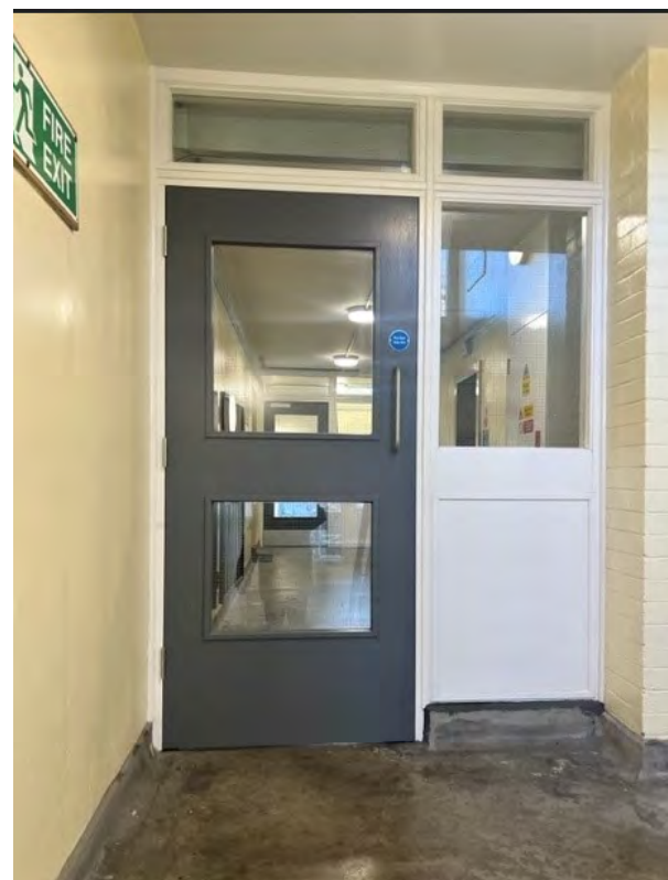
Communal Fire Door at The Combe.