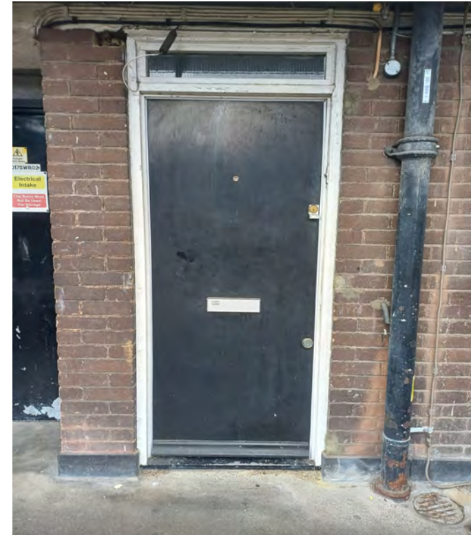
Front Entrance Door at Fairfield.