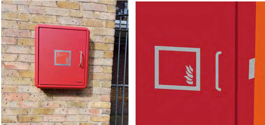
Secure Information Box at Fairfield.

Secure Information Boxes are easily identifiable storage units for documents intended for use by the fire and rescue service during a fire.