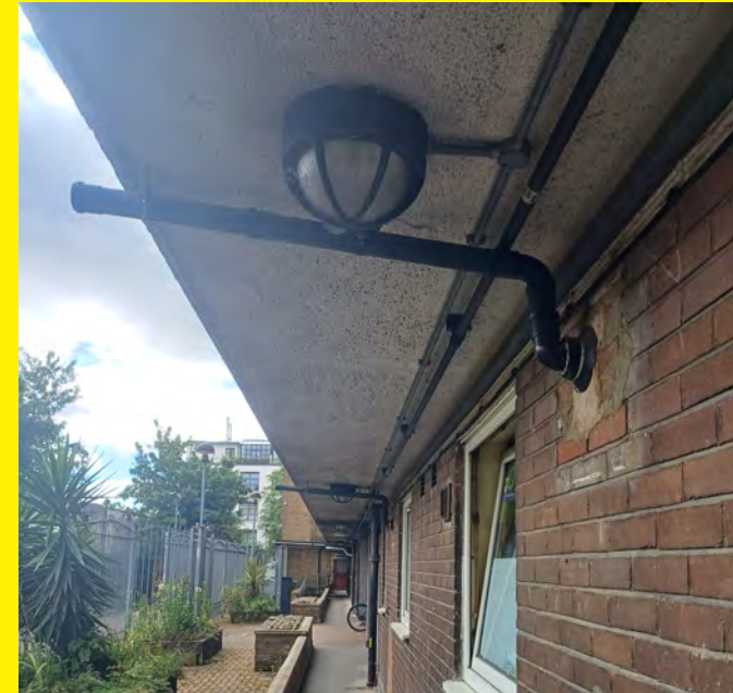
Emergency lighting at Fairfield.

Emergency lighting provides illumination in instances where mains power may have failed. It illuminates escape routes, emergency exit/s and firefighting equipment. It will provide illumination to signage and provide sufficient lighting to help you to escape.