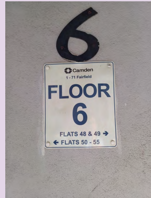
Wayfinding signage at Fairfield.

Wayfinding signage is a visual communication tool to assist the Fire and Rescue Service in locating specific flats as they navigate their way round a building.