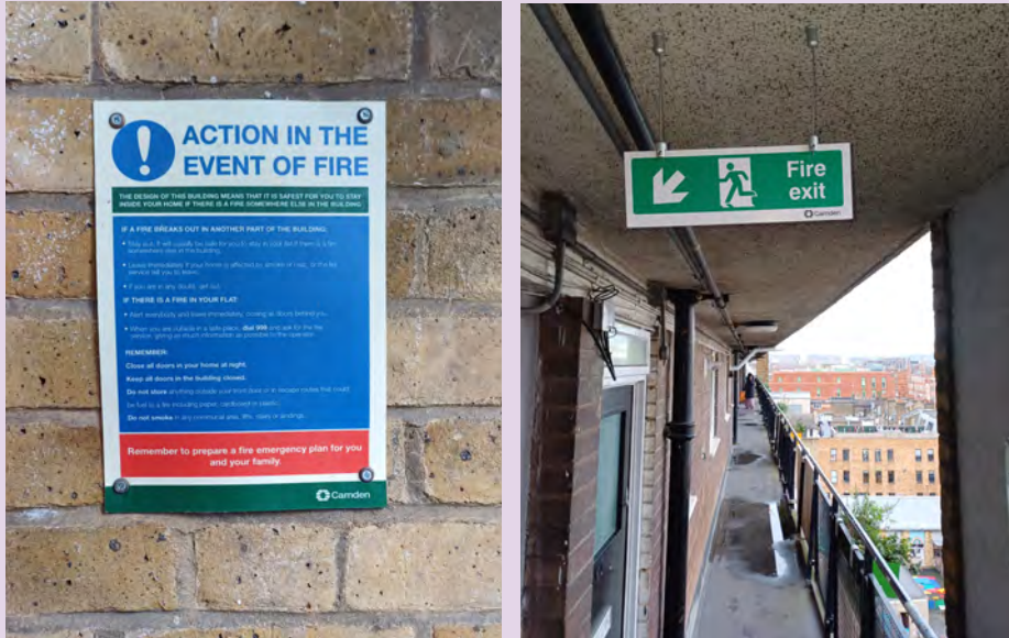
Fire Action Notice and Fire Exit Signs at Fairfield.

We have installed Fire Action Notices and Fire Exit Signs in your building.