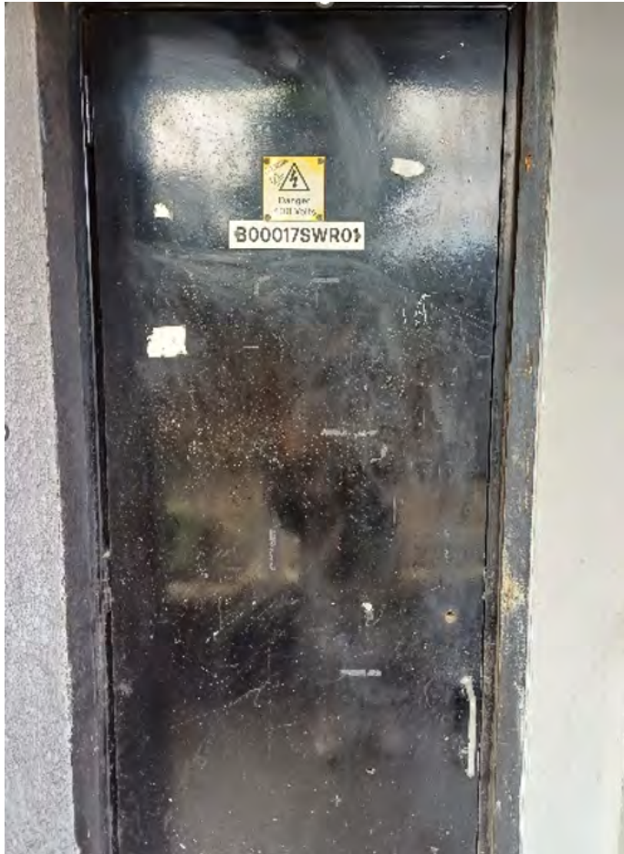
Electrical Intake cupboard Fire Door at Fairfield.

Doors to plant rooms, electrical intake and lift motor rooms (including fire rated hatches or panels)