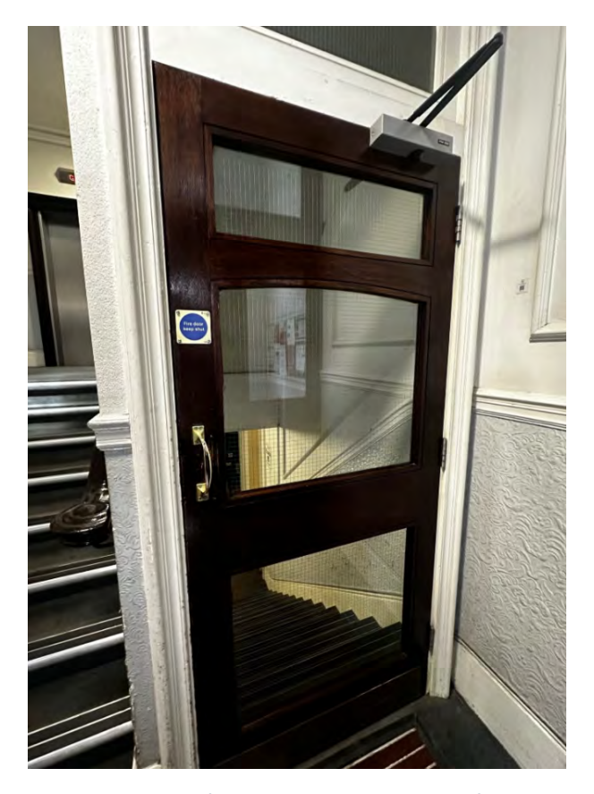
Communal Fire Door at Gordon Mansions.