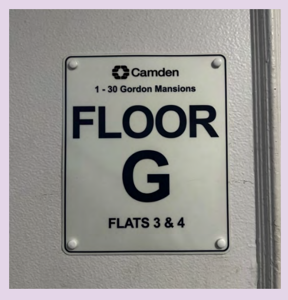
Wayfinding signage at Gordon Mansions.

Wayfinding signage is a visual communication tool to assist the Fire and Rescue Service in locating specific flats as they navigate their way round a building.