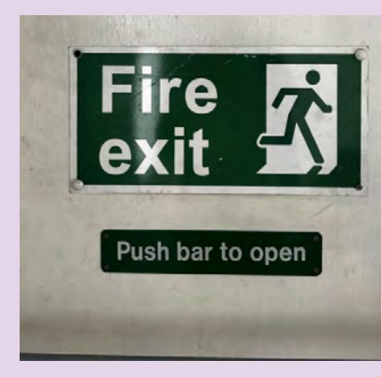
Fire Action Notice and Fire Exit Sign at Gordon Mansions.