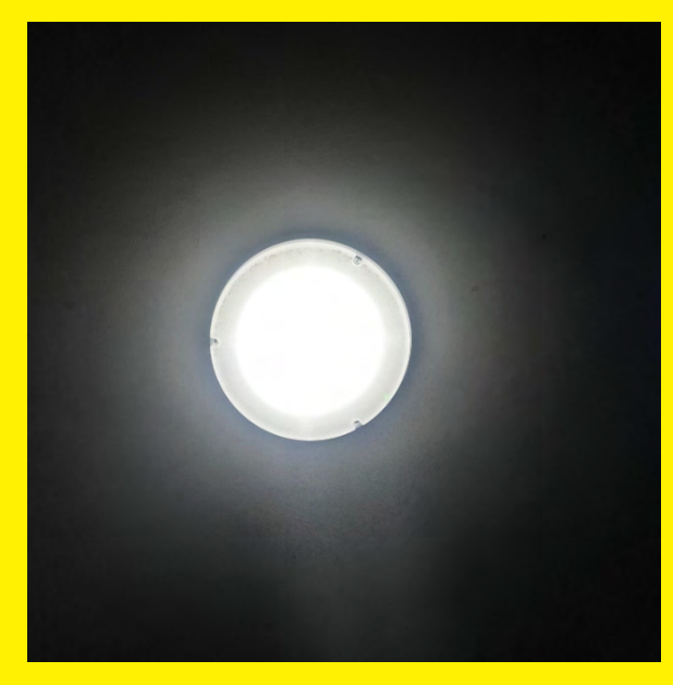
Emergency lighting at Gordon Mansions.

Emergency lighting provides illumination in instances where mains power may have failed. It illuminates escape routes, emergency exit/s and firefighting equipment. It will provide illumination to signage and provide sufficient lighting to help you to escape.