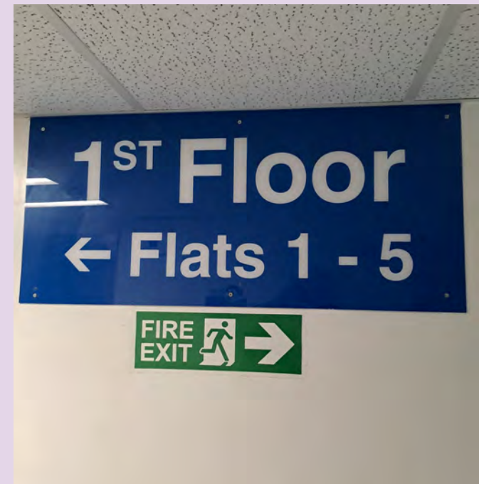
Wayfinding signage at Denton.

Wayfinding signage is a visual communication tool to assist the Fire and Rescue Service in locating specific flats as they navigate their way round a building.