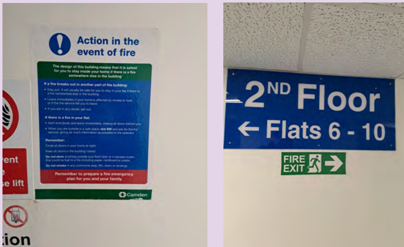
Fire Action Notice at Denton.

We have installed Fire Action Notices and Fire Exit Signs in your building.