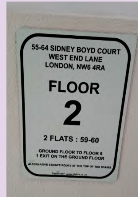
Wayfinding signage at Sidney Boyd Court.

Wayfinding signage is a visual communication tool to assist the Fire and Rescue Service in locating specific flats as they navigate their way round a building.