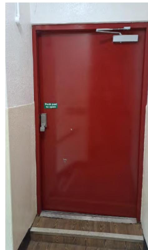
Cross connection Fire Door at Sidney Boyd Court