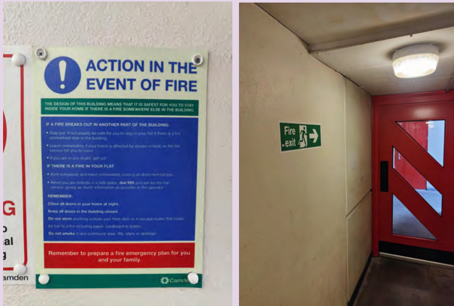
Fire Action Notice and Fire Exit Sign at Foundling Court.

We have installed Fire Action Notices and Fire Exit Signs in your building.