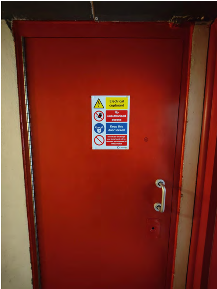
Electrical Intake Cupboard Fire Door at Foundling Court.

Doors to plant rooms, electrical intake and lift motor rooms (including fire rated hatches or panels)