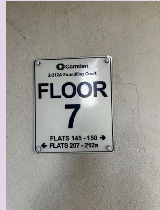
Wayfinding signage at Foundling Court.

Wayfinding signage is a visual communication tool to assist the Fire and Rescue Service in locating specific flats as they navigate their way round a building.