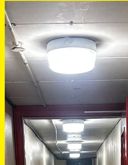
Emergency lighting at Foundling Court.

Emergency lighting provides illumination in instances where mains power may have failed. It illuminates escape routes, emergency exit/s and firefighting equipment. It will provide illumination to signage and provide sufficient lighting to help you to escape.