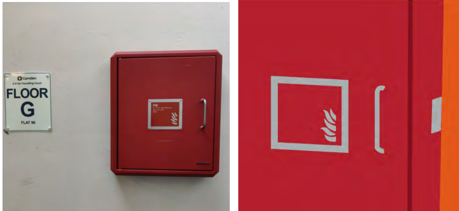
Secure Information Box at Foundling Court

Secure Information Boxes are easily identifiable storage units for documents intended for use by the fire and rescue service during a fire.