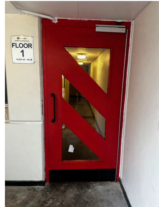
Communal Fire Door at Foundling Court.