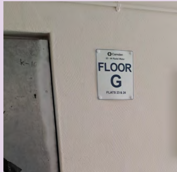
Wayfinding signage at 23-44 Rydal Water.

Wayfinding signage is a visual communication tool to assist the Fire and Rescue Service in locating specific flats as they navigate their way round a building.