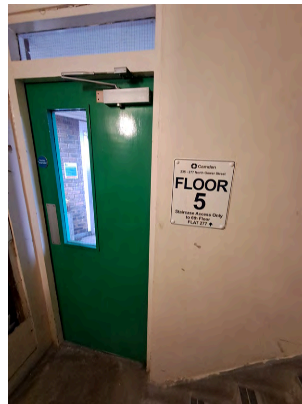
Communal Fire Door a 235-277 North Gower Street