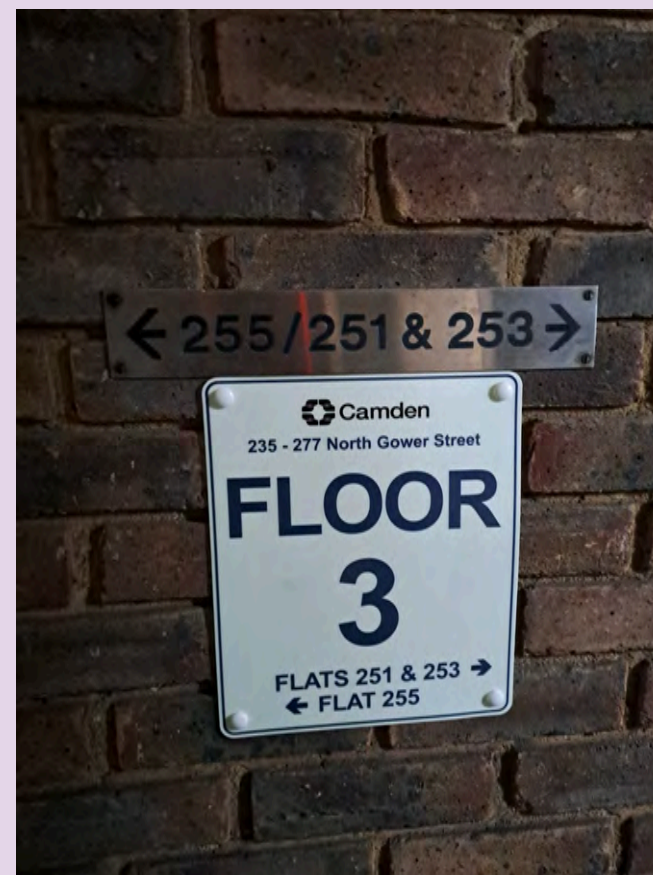
Wayfinding signage at 235-277 North Gower Street

Wayfinding signage is a visual communication tool to assist the Fire and Rescue Service in locating specific flats as they navigate their way round a building.