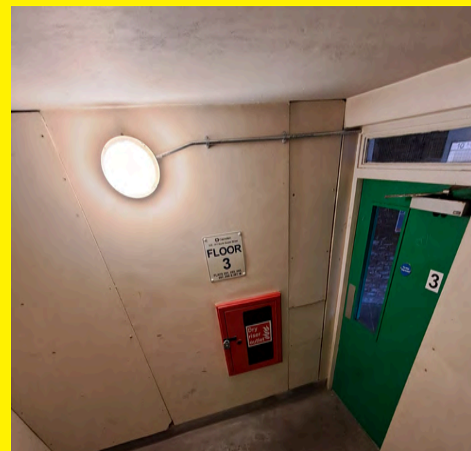
Emergency lighting at North Gower Street

An emergency lighting system is generally comprised of self-contained 3hr battery back-up-maintained LED luminaires.