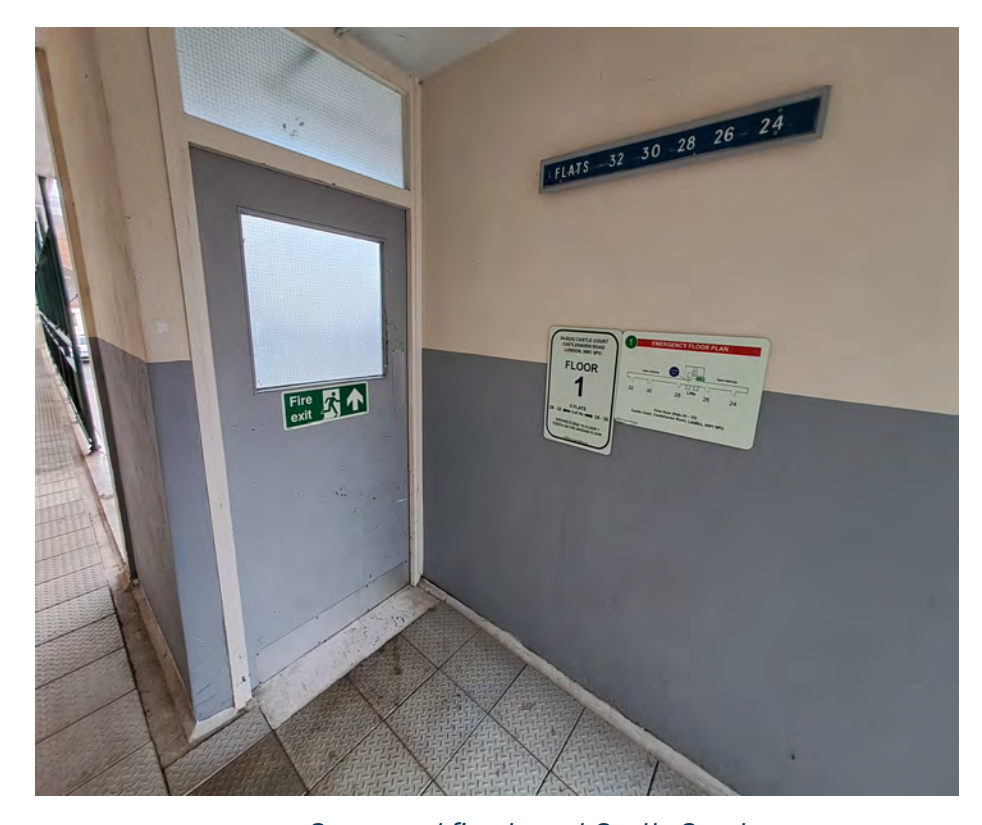
Communal fire door at Castle Court.