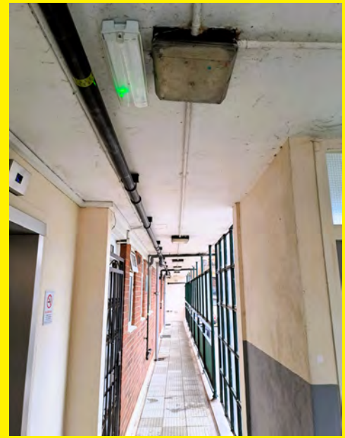
Internal and external emergency lighting at Castle Court.

Emergency lighting at Castle Court can be found in stairwells and in open deck access communal areas.