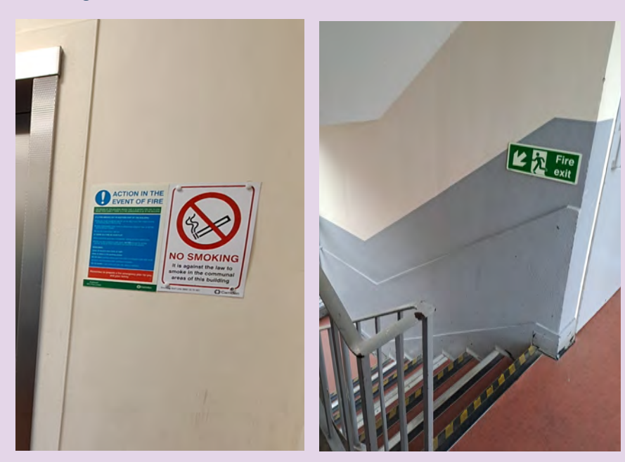
Fire Action Notices and Fire Exit Sign at Castle Court.

We have installed Fire Action Notices and Fire Exit Signs in your building.