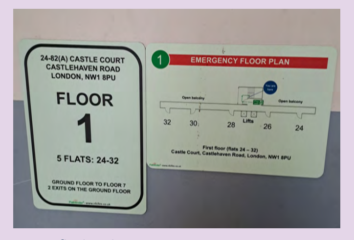
Wayfinding signage at Castle Court.

Wayfinding signage is a visual communication tool to assist the Fire and Rescue Service in locating specific flats as they navigate their way round a building.