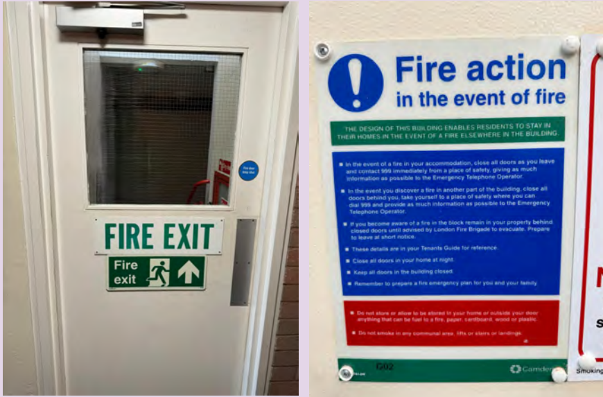
Fire Action Notice and Fire Exit Sign at 25 Gresse Street.

We have installed Fire Action Notices and Fire Exit Signs in your building.