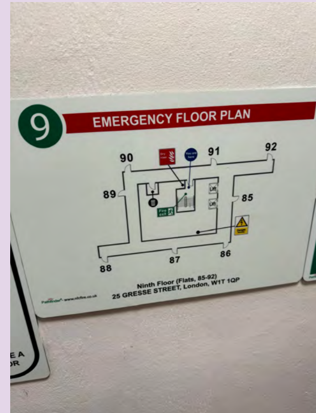
Wayfinding signage at 25 Gresse Street.

Wayfinding signage is a visual communication tool to assist the Fire and Rescue Service in locating specific flats as they navigate their way round a building.