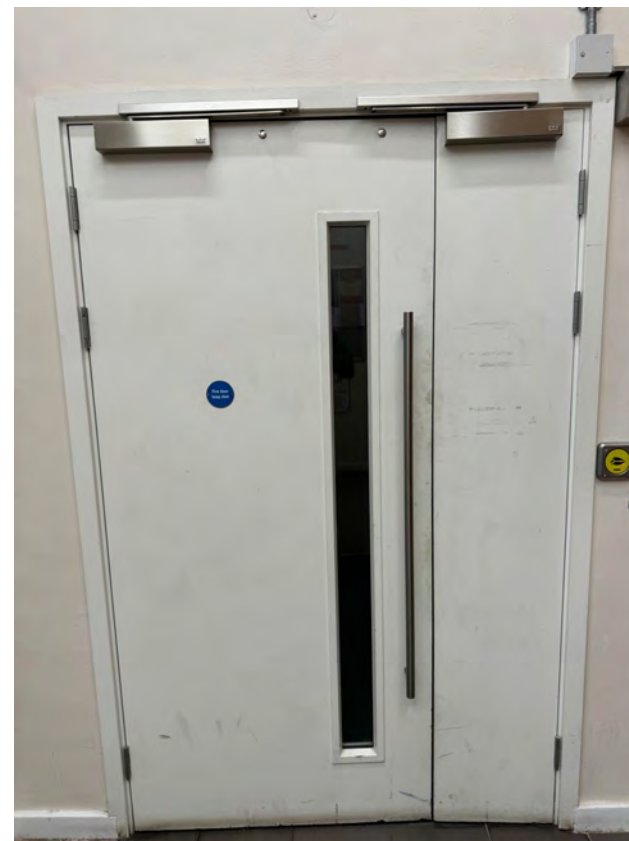
Communal Fire Door at 25 Gresse Street.