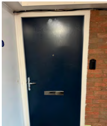
Front Entrance Door at 25 Gresse Street.

In your building, communal doors and doors to stairwells are fire doors. Your front door may be a fire door.