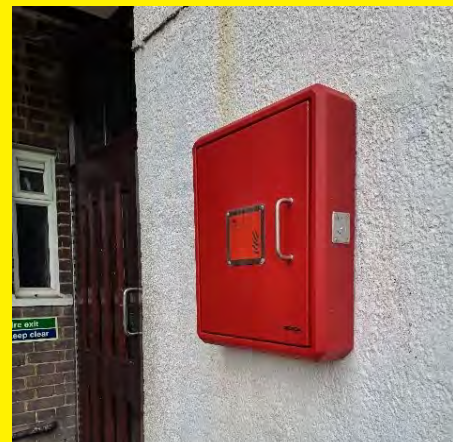
Secure Information Box at Templar.

We may contact you about an emergency plan or request your consent to refer you to the most appropriate council service.