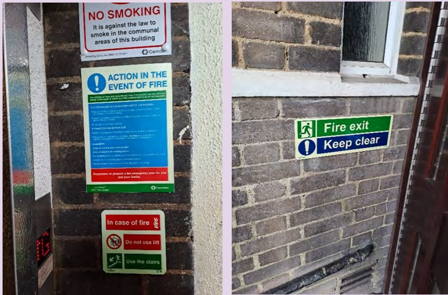
Fire Action Notice and Fire Exit signage at Templar House.

We have installed Fire Action Notices and Fire exit signs in your building.