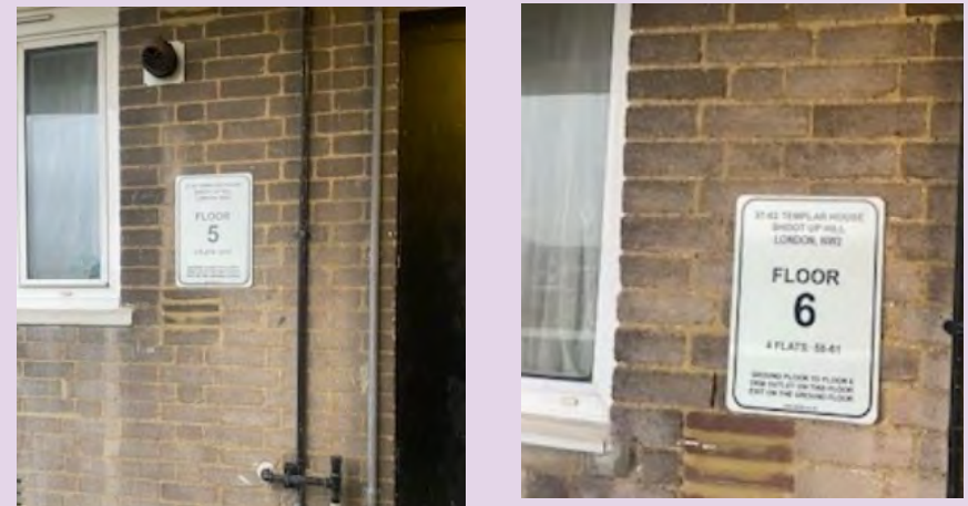
Wayfinding signage at Templar House.

Wayfinding signage is a visual communication tool to assist the Fire and Rescue Service in locating specific flats as they navigate their way round a building.