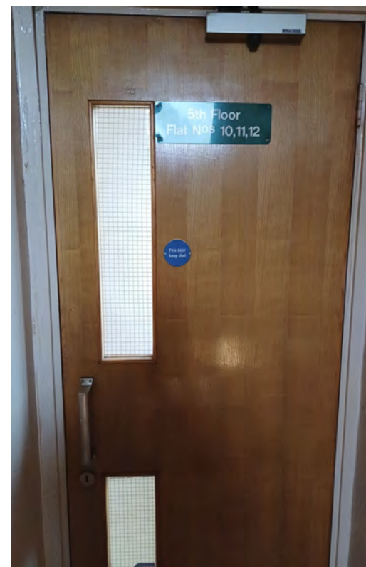
Communal fire door at 50 Britannia Street.