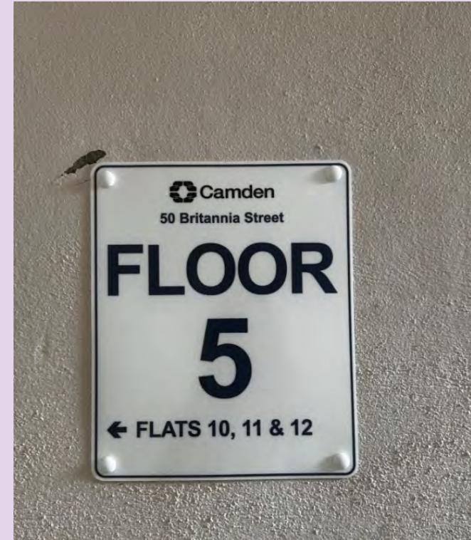
Wayfinding signage at 50 Britannia Street.

Wayfinding signage is a visual communication tool to assist the Fire and Rescue Service in locating specific flats as they navigate their way round a building.