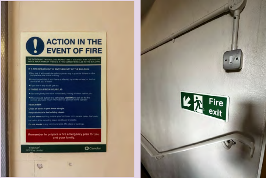
Fire Action Notice and Fire Exit Sign at 50 Britannia Street.

We have installed Fire Action Notices and Fire Exit Signs in your building.