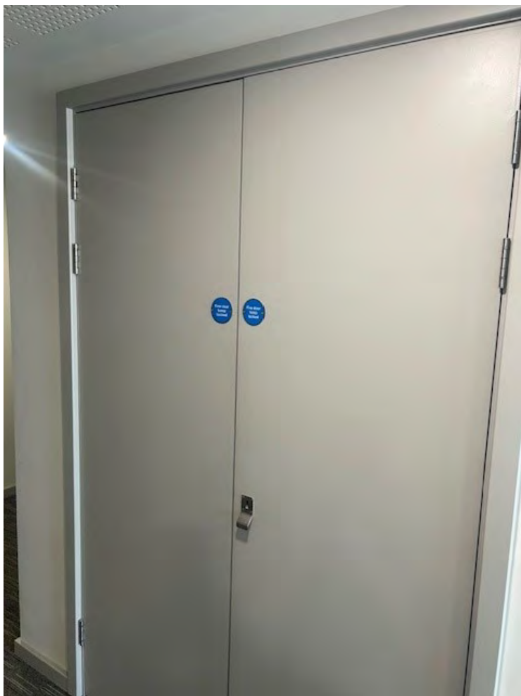
Cupboard fire doors at 9A York Way.

Doors to plant rooms, electrical intake and lift motor rooms (including fire rated hatches or panels)