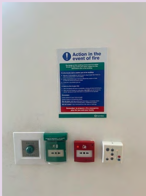
Fire Action Notice at 9A York Way.

We have installed Fire Action Notices and Fire Exit Signs in your building.