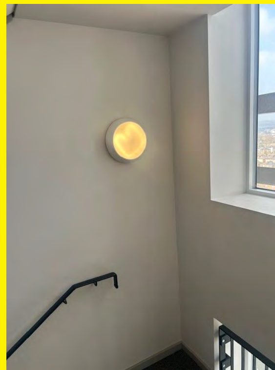
Emergency lighting in stairwell at 9A York Way.

An emergency lighting system is generally comprised of self-contained 3hr battery back-up-maintained LED luminaires.