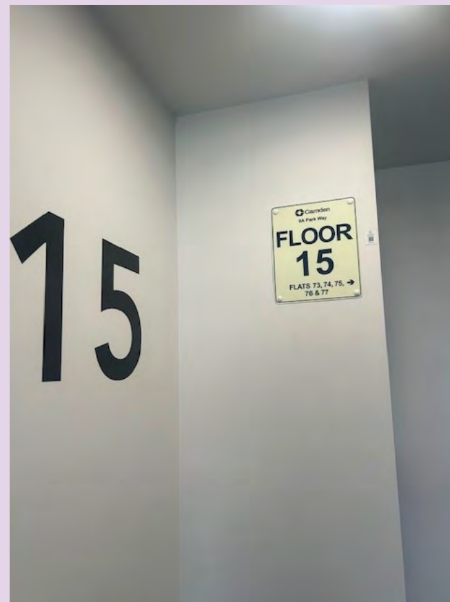
Various wayfinding signage at 9A York Way.

Wayfinding signage is a visual communication tool to assist the Fire and Rescue Service in locating specific flats as they navigate their way round a building.