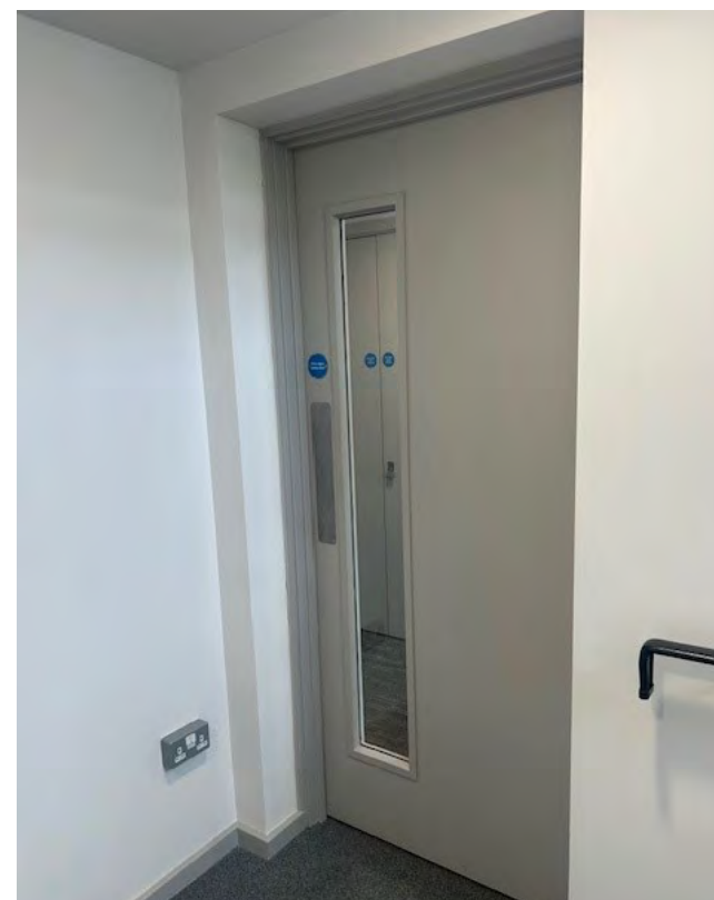
Communal area fire door at 9A York Way.