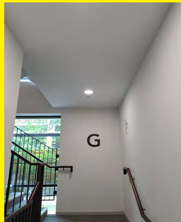
Stairwell emergency lighting at 9C York Way.

An emergency lighting system is generally comprised of self-contained 3hr battery back-up-maintained LED luminaires.