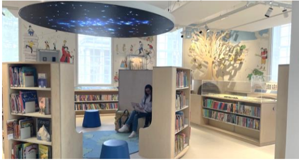
Tunbridge Wells - Amelia Scott