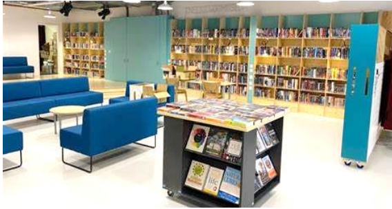
Enfield - Fore Street Library