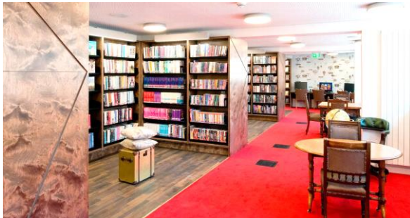
Chester - Story House