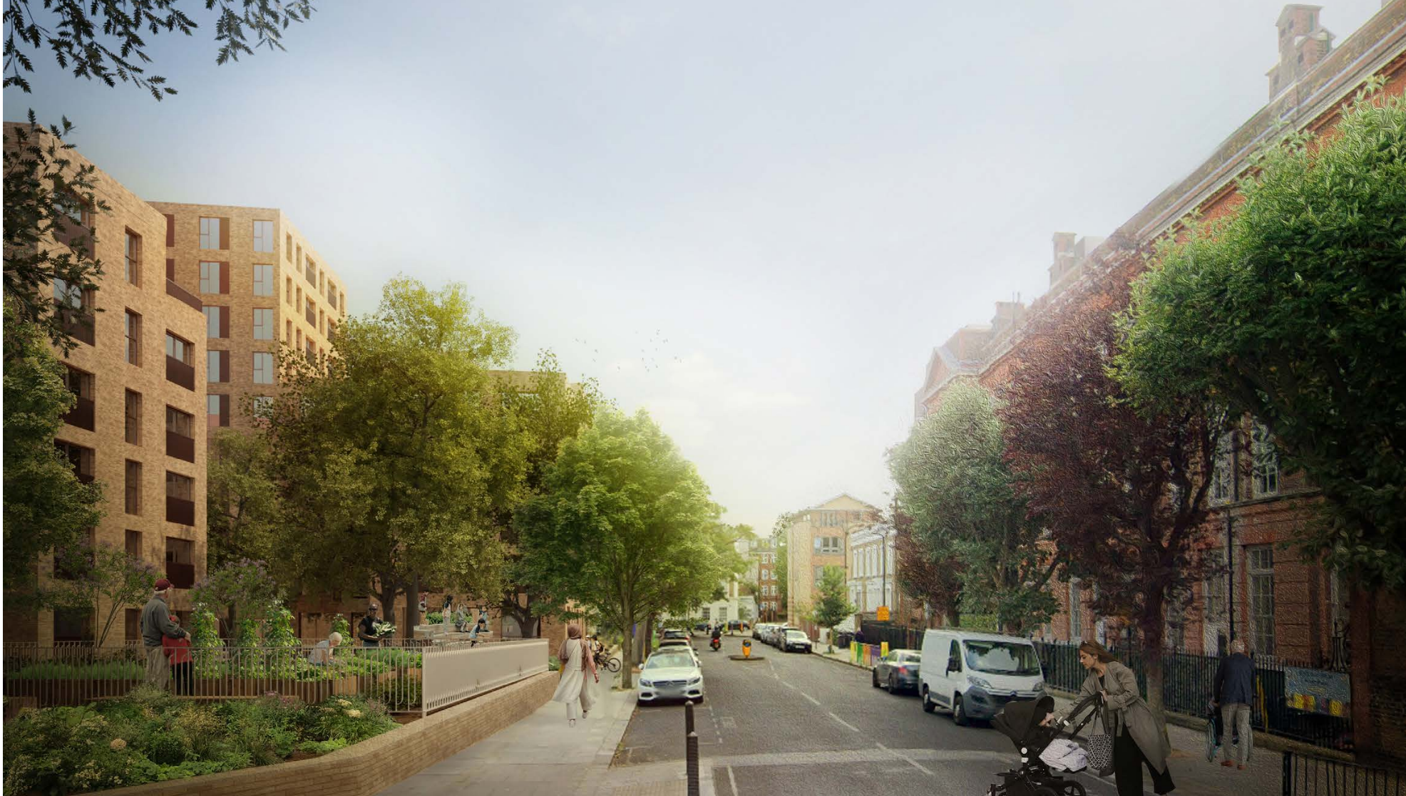
Illustrative View from Rhyl Street with new E blocks and the Grow Garden