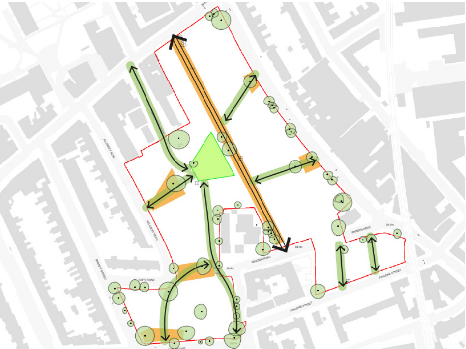
5 Establishing a legible public realm structure