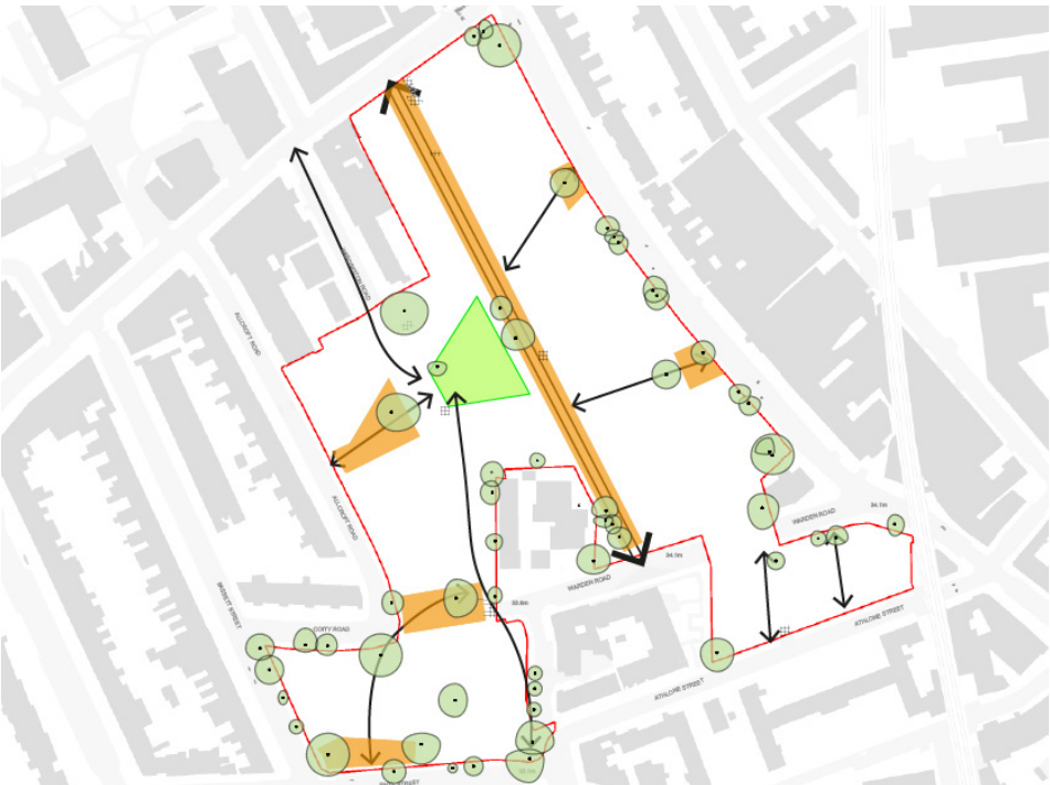
4 Forming gateways and arrival spaces