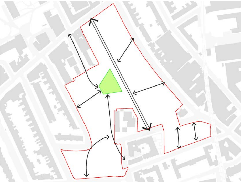
1 Public realm focus