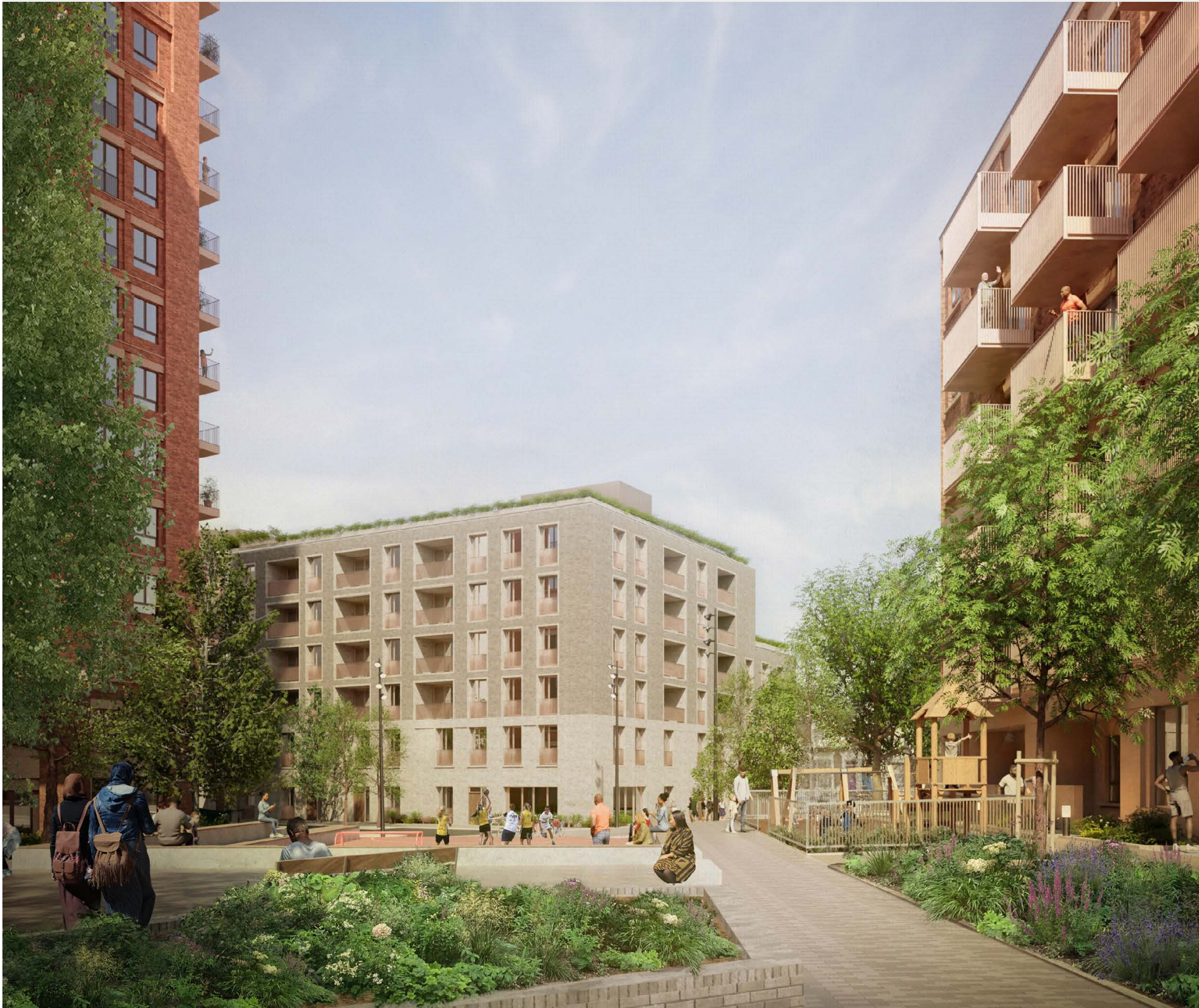
Illustrative View of New Central Square

The development’s indicative phasing strategy is designed to minimize disruption and offsite decants for existing residents, developed in coordination with Camden. This strategy will be refined as outline plots progress to detailed design and Reserved Matters Applications. The overall construction is anticipated to span 20 years, with all resident rehousing expected to be complete by Phase 6.