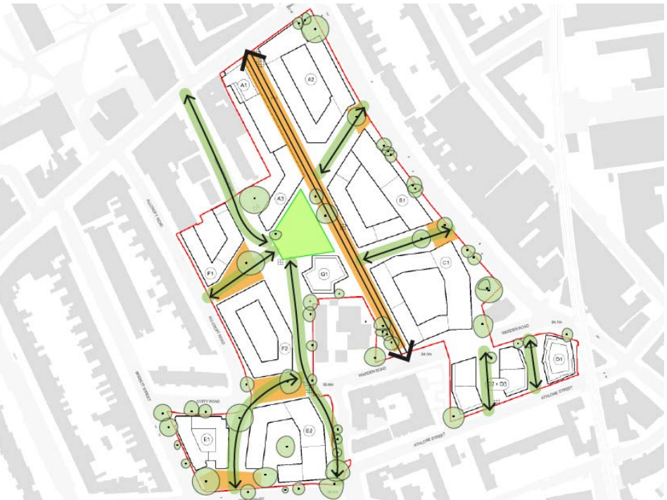
5 Plots are shaped around public realm structure