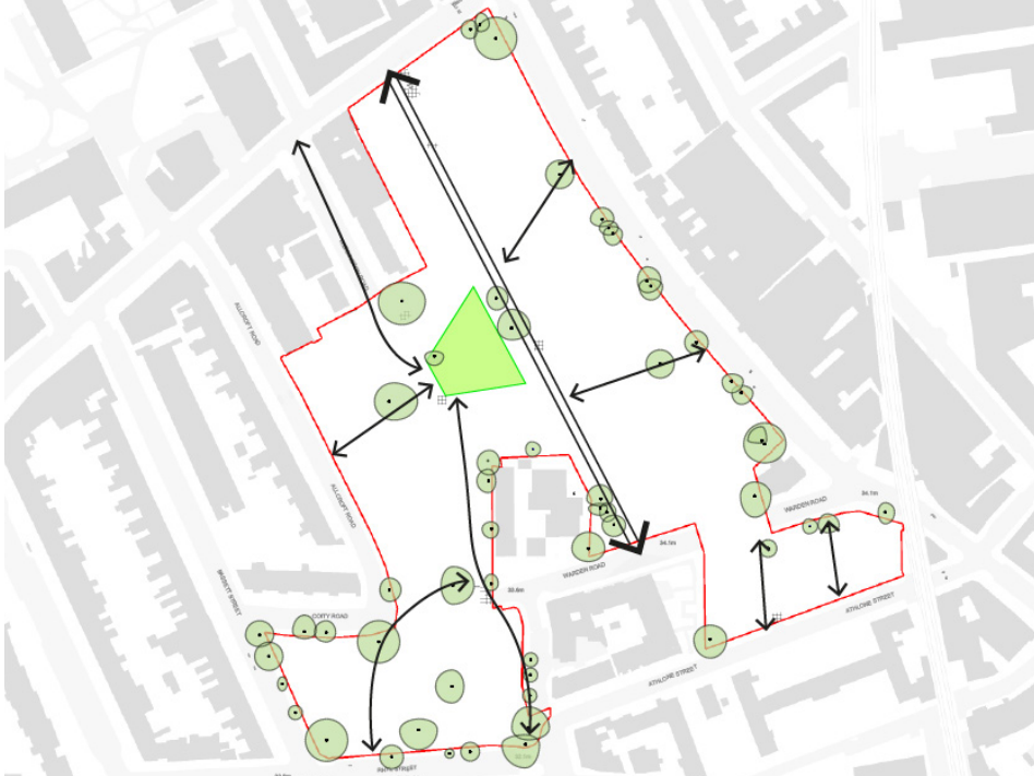
2 Retained existing tree stock